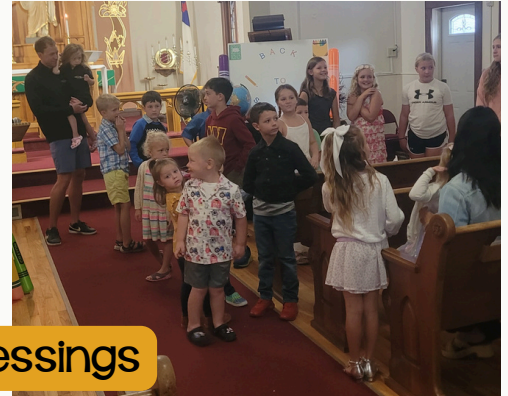
Rally Day & Back to School Blessings