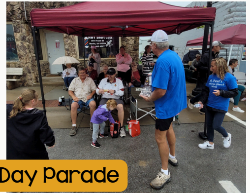
The church float in the HooDoo Day Parade