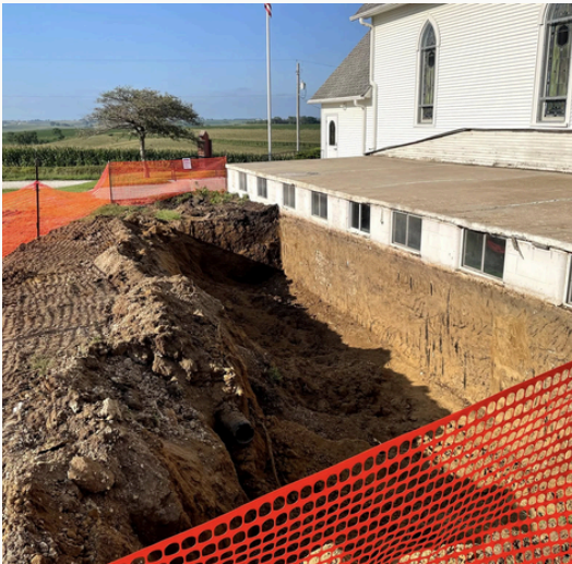
Construction has begun at St. Paul's!

22163 SUMAC RD NEOLA, IA 51559 | (712)485-3042