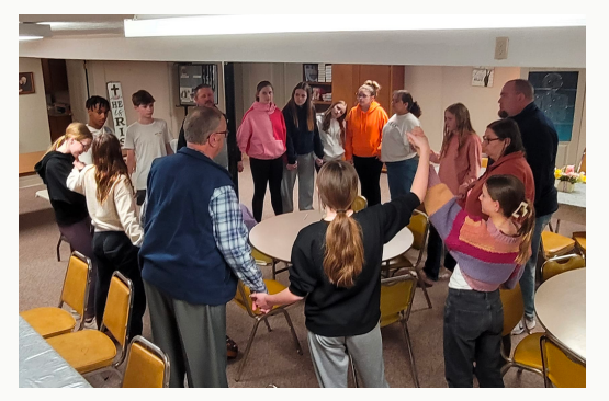
The 316 Group gathered for food, fellowship, and sharing the word of God with area youth!

Acts 8:26-40, Psalm 150:1-6, 1 John 4:1-11, 12-21