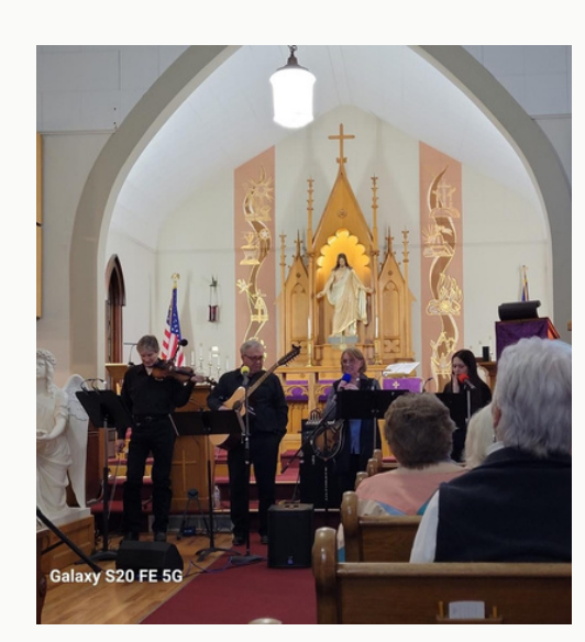
We welcomed Heaven Bound in concert and enjoyed great music!

Easter Service will be March 31st at 7:00 am.