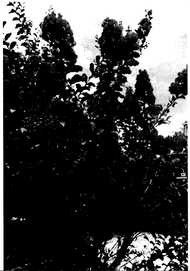
Garden Grove Parkway is a beautiful site in the summer when the Crape Myrtles are in bloom!

Bickering with your spouse is like trying to read the Terms of Use for a new service; in the end, you just give up and click "I Agree"