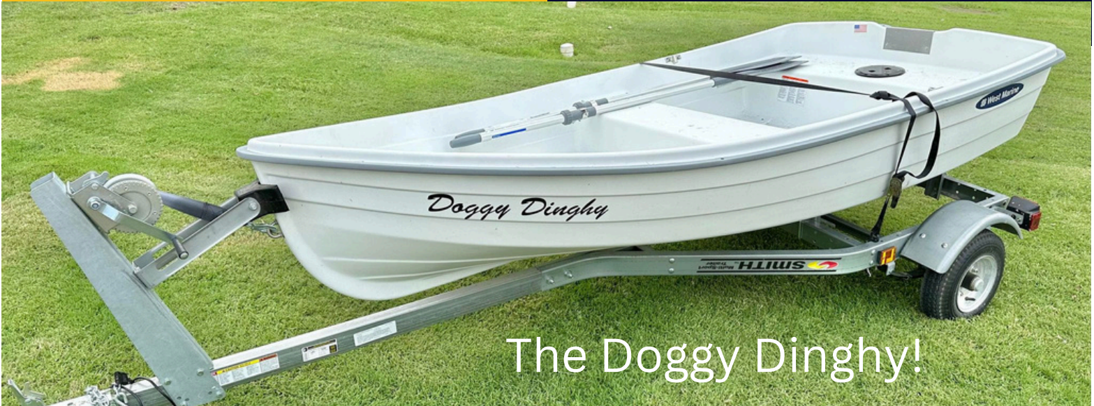
The Doggy Dinghy!