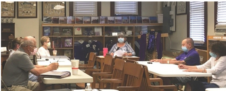
Historical Society Board members wear masks and social distance during their monthly meetings in the Museum's Lower Level.