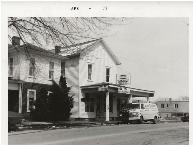
↑ April, 1973: T.V. Repair Shop/Don Hixson's Office along with Shoemaker home located at NW corner of W. Columbus/Center Streets in downtown Pickerington. "Dude" Harrell's Standard Oil Station can be seen across the street.