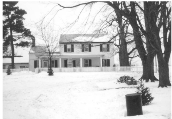
↑ 1978 photo of Pickerington's municipal offices in Sycamore Creek park after two stages of remodeling. The building was razed when a new City Hall was constructed in 1992.