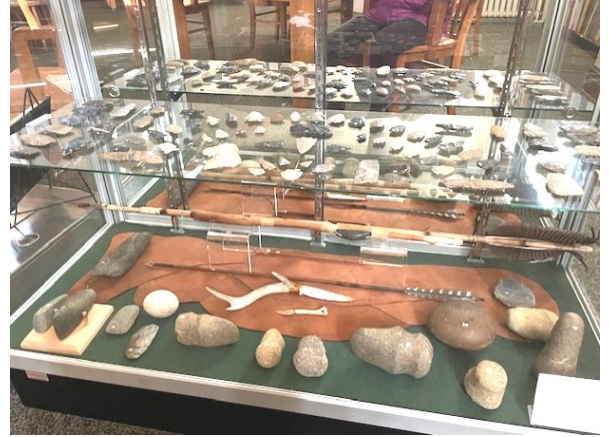
↑ See these ancient tools & weapons gathered near our Museum. The collection was donated by Earlene and Bill Corbin.