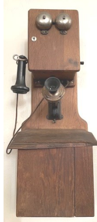
↑ Vintage Party-line telephone.