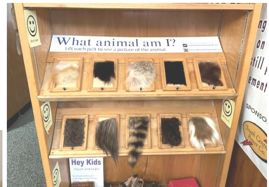
↑ This is one of visiting kids' favorite Museum displays thanks to help from Fairfield Federal Savings & Loan.