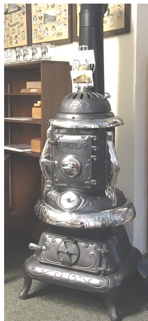
← Donated by Historical Society members Earlene and Bill Corbin, this mid-1800s potbelly cast iron stove kept students warm during winters at the Peru one-room school on Stemen Road. That building still stands!