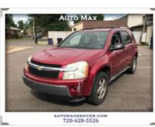
2005 Chevrolet Equinox