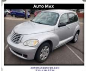
2008 Chrysler PT Cruiser