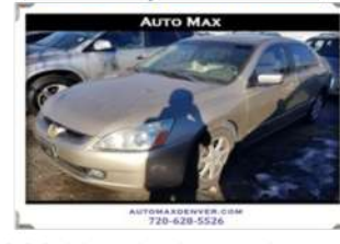
2003 Honda Accord