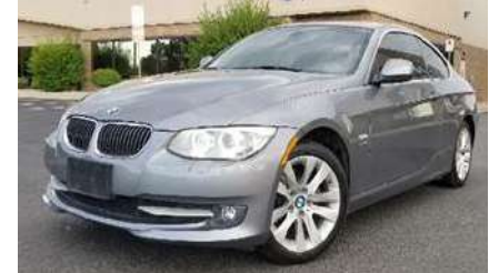
2011 BMW 3 Series AWD 328i $10,995