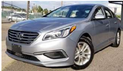
2016 Hyundai Sonata SE Sedan $11,995