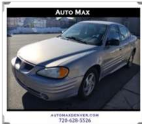
2000 Pontiac Grand Am