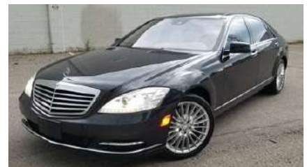
2002 Mercedes-Benz S 500 $8,499