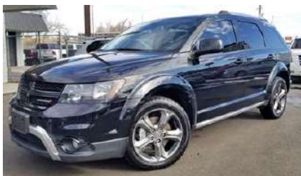
2015 Dodge Journey AWD $11,995