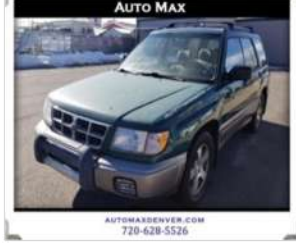
1998 Subaru Forester