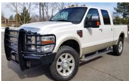
2010 Ford F-250 King Ranch $27,499