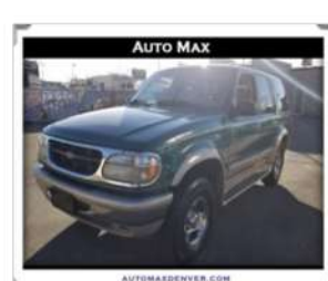
1998 Ford Explorer