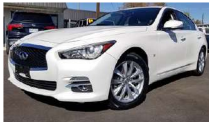
2015 Infiniti Q50 AWD $19,995