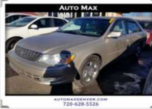
2003 Toyota Avalon