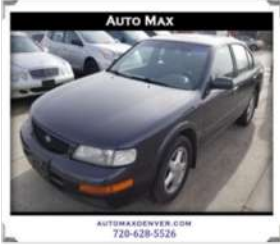
1995 Nissan Maxima