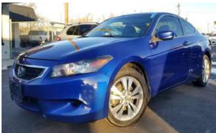
2010 Honda Accord $7,499