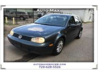
2004 Volkswagen Golf