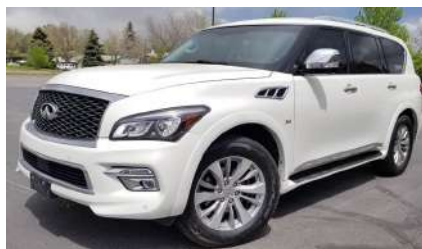
2016 Infiniti QX80 SUV $33,995 Sold