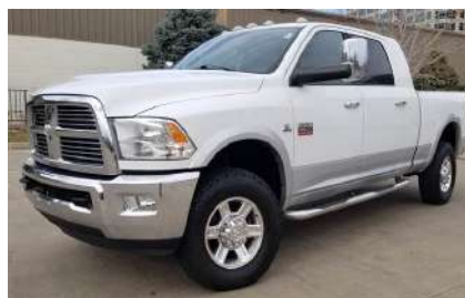
2012 Dodge Ram Laramie $34,999