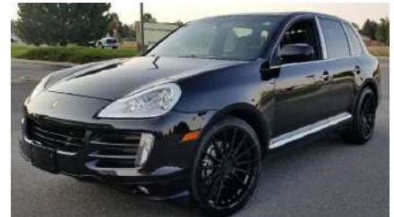
2009 Porsche Cayenne SUV $16,995