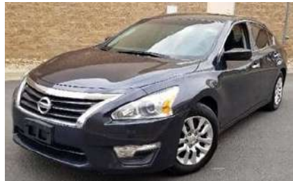
2015 Nissan Altima 2.5 S $11,995