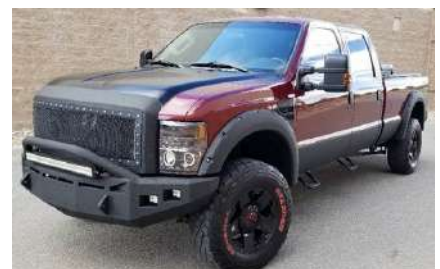
2008 Ford F-350 Super Duty $19,995