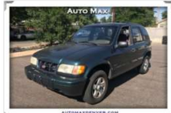
2000 Kia Sportage