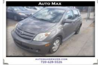
2005 Scion xA