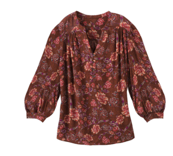
MARIPOSA BLOUSE $74 • 34124076T • XS-XXL