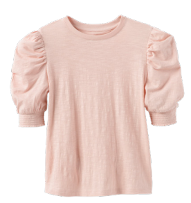
CALICO HILLS TOP $44 • 34124070T • XS-XXL