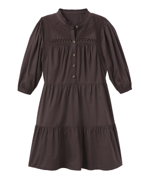
MIDNIGHT SKY DRESS $98 • 34124014D • XS-XXL