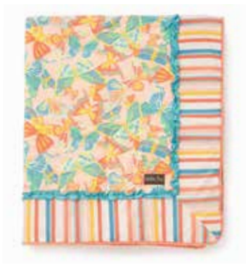
YOU GIVE ME BUTTERFLIES PROMO BLANKET *NEW!* | 31804A | OS

$30 WITH A PURCHASE OF $175+ OR FREE FOR JANES WHO HOST AN $800+ SHOW!