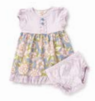
WONDER AND WANDER DRESS