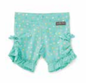
SPRINKLE CANDY SHORTIE *NEW!* | 31211B | 2-16y $32