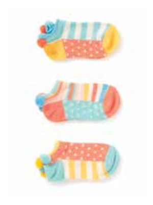
SUPERSTAR SOCK SET *NEW!* | 31321A | S-L $18