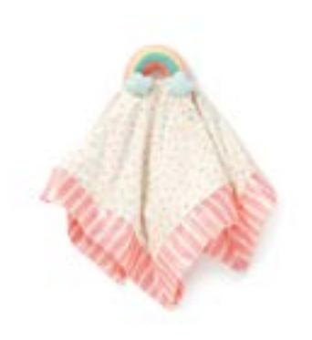
DREAMING OF RAINBOWS LOVEY *NEW!* | 31522A | OS $24