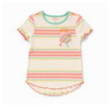
READY FOR THE PARADE TEE *NEW!* | 31111T | 2-16y $34