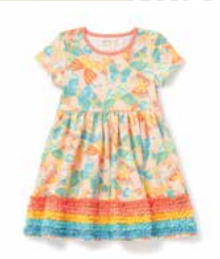
CHASING BUTTERFLIES DRESS *NEW!* | 31023D | 2-16y $48