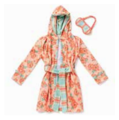
SUMMER SHOWERS ROBE SET *NEW!* | 31JAM6P | XS-XXL $48