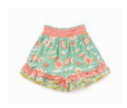
FUN HOUSE SHORT *NEW!* | 31209B | 2-16y $34