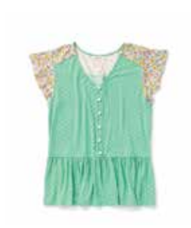
FREE TO BE TOP *NEW!* | 31681T | XS-XXL $54