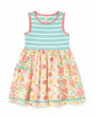
*NEW!* | 31036D | 2-16y