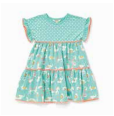
FUN AT THE CIRCUS DRESS *NEW!* | 31017D | 2-16y $44