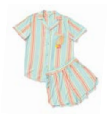
GOODNIGHT STRIPES PJ SET *NEW!* | 31637P | XS-XXL $68