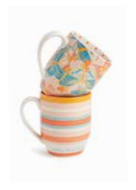
HAVE A GOOD MORNING MUG SET SIP SIP HOORAY TUMBLER *NEW!* | 31511A | OS $24