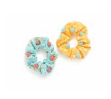
*NEW!* | 31308A | OS $14