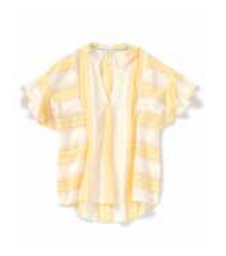
SUMMER PICNIC TOP $64