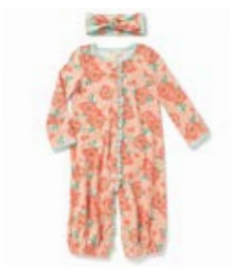
DOZING OFF CONVERTIBLE SET *NEW!* | 319230 | NB to 18-24m $36