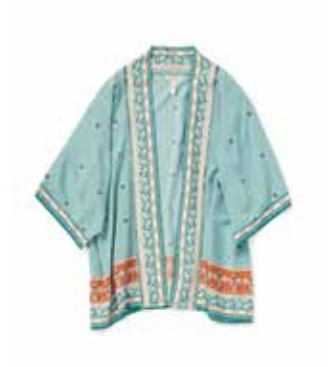
DAYS LIKE THIS KIMONO $68