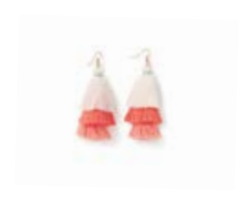
TASSELED OUT EARRINGS *NEW!* | 31520A | OS $18