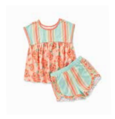
GARDEN DREAMS PJ SET *NEW!* | 31JAM4P | 2-16y