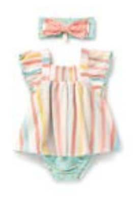
CARNIVAL TIME SET $42