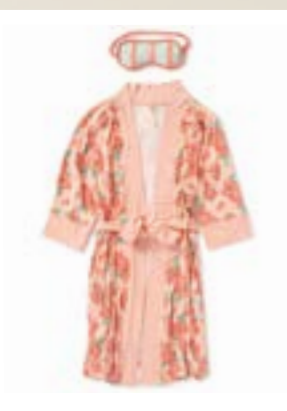
WINDING DOWN ROBE SET *NEW!* | 31638P | XS-XXL $68