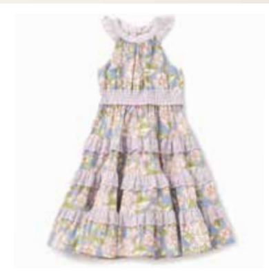
OFF TO WONDERLAND DRESS *NEW!* | 31014D | 2-16y $72