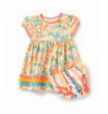
BUTTERFLY BEAUTY DRESS *NEW!* | 31921D | NB to 18-24m $42