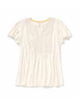
IN THE WIND TOP $54