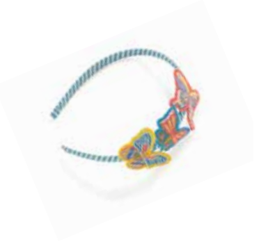
HULA HOOP SCRUNCHIE SET MONARCH DAYDREAM HEADBAND *NEW!* | 31315A | OS $16