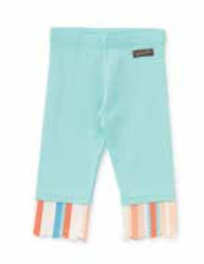
RAINBOW SHERBERT CROPPED LEGGING *NEW!* | 31212B | 2-16y $34