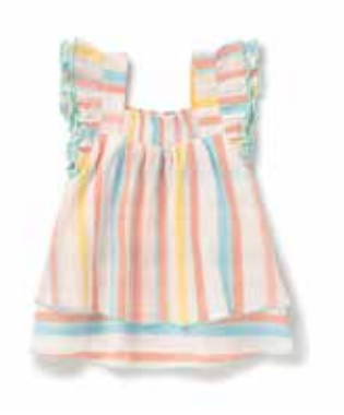
CARNIVAL RIDE TUNIC *NEW!* | 31113T | 2-16y $42