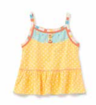
SO SUNNY TANK TOP *NEW!* | 31112T | 2-16y $34