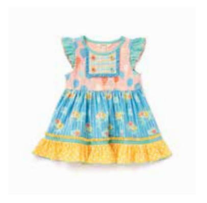
BALLOON PLAY TUNIC *NEW!* | 31142T | 2-16y $42