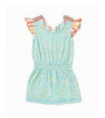
CONFETTI PARTY ROMPER *NEW!* | 31016R | 2-16y $48