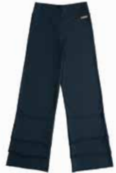
WOMEN'S FINN 22607B | XS-XXL $58