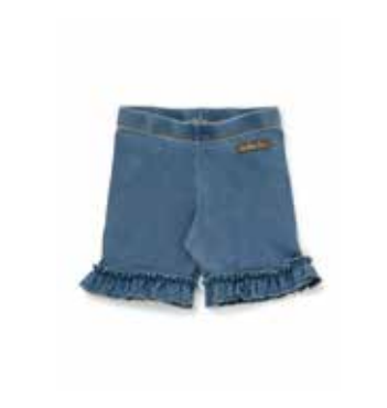
SWINGSET JORTIE 29231B | 2-16y $34