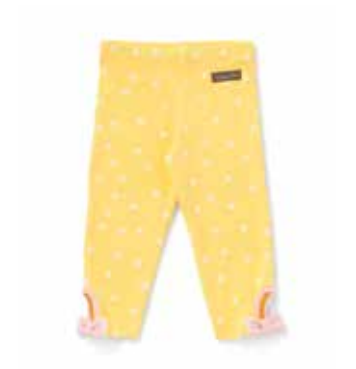
YELLOW SUBMARINE CROPPED LEGGING *NEW!* | 31206B | 2-16y $34