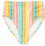
COLORFUL COAST SWIMSUIT BOTTOM *NEW!* | 31675S | XS-XXL $48