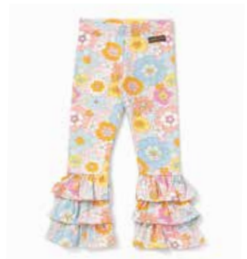
REALLY RETRO BENNY *NEW!* | 31205B | 2-16y $36