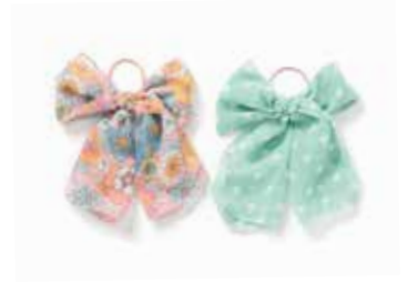
TOTALLY TIED HAIR BOWS *NEW!* | 31302A | OS $18