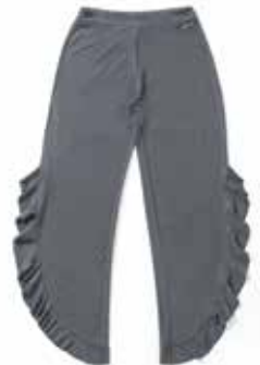
CASCADING RUFFLE - IRON *NEW!* | 31621B | XS-XXL $58