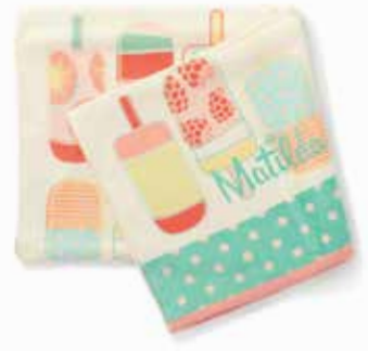
SWEET POPSICLES BEACH TOWEL *NEW!* | 31504A | OS $36