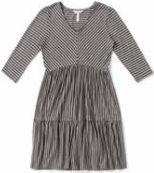
LOVELY DAY DRESS *NEW!* | 31611D | XS-XXL $68