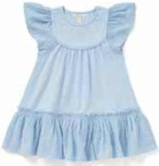
OH JOY DRESS *NEW!* | 31002D | 2-16y $48