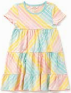
TWIRLY RAINBOWS DRESS *NEW!* | 31003D | 2-16y $44