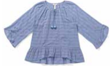
PRETTY THING BLOUSE *NEW!* | 31625T | XS-XXL $64