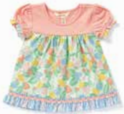
TOTALLY TULIP TUNIC *NEW!* | 31912T | NB to 18-24m $34