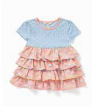
PIECE OF CAKE TOP *NEW!* | 31120T | 2-16y $42