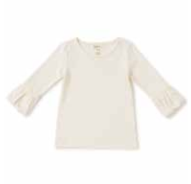
GIRLS' PUFFER TEE - EGRET 26208T | 2-16y $28