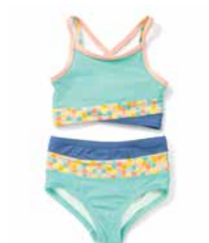
CANDY DOTS SWIMSUIT *NEW!* | 31SWM4S | 2-16y $48