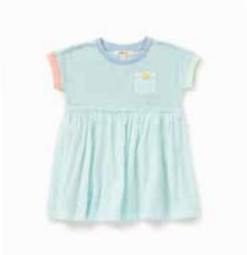
CANDID CUTIE TOP *NEW!* | 31138T | 2-16y $42