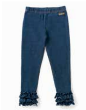
GIRLS' RUFFLE JEGGING BAG209B | 2-16y $36