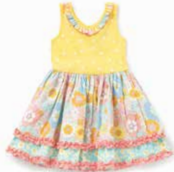
DANCE TIME DRESS *NEW!* | 31005D | 2-16y $58