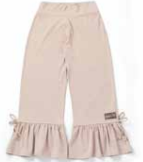
WOMEN'S BIG RUFFLE - SPHYNX *NEW!* | 31601B | XS-XXL $58