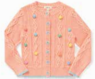
LOOKIN' PEACHY CARDIGAN *NEW!* | 31125T | 2-16y $48