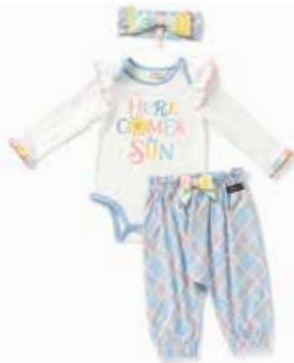
BABY SUNSHINE SET *NEW!* | 31914C | NB to 18-24m $44