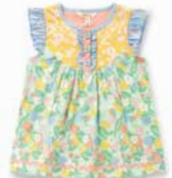
LOVE NOTE TUNIC *NEW!* | 31105T | 2-16y $38