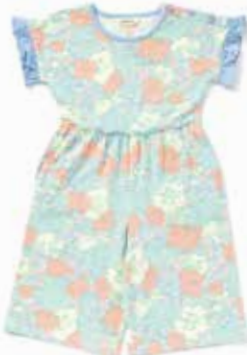
FAR OUT FLORAL CROPPED ROMPER *NEW!* | 31006R | 2-16y $54