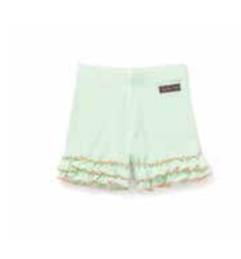
LIME LOLLIPOP SHORTIE *NEW!* | 31215B | 2-16y $32