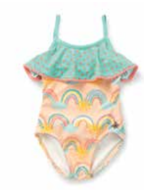
RAINBOW GROOVE SWIMSUIT *NEW!* | 31SWM1S | 6-12m-16y $38