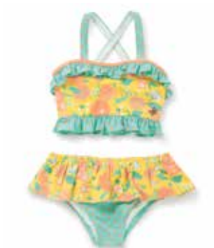
SWEETHEART TWIRL SWIMSUIT *NEW!* | 31SWM2S | 2-16y $48