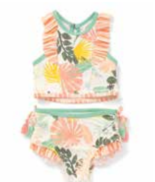
ON AN ISLAND SWIMSUIT *NEW!* | 31SWM6S | 2-16y $48