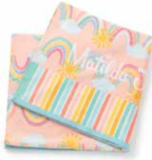
RAINBOW DREAMS BEACH TOWEL *NEW!* | 31503A | OS $36