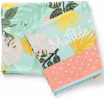
TALK TROPICAL BEACH TOWEL *NEW!* | 31550A | OS $36