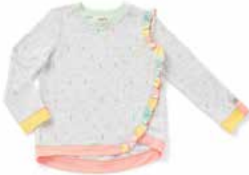
WISH ON A STAR SWEATSHIRT *NEW!* | 31104T | 2-16y $44