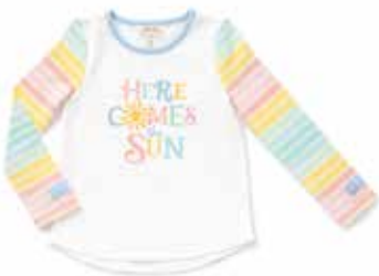
HERE COMES THE SUN TEE *NEW!* | 31103T | 2-16y $36