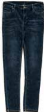
WOMEN'S DARK WASH JEAN BAW606B | 0-22 $88