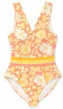
SO PEACHY SWIMSUIT *NEW!* | 31676S | XS-XXL $78