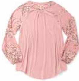
DOSE OF FLORAL TOP *NEW!* | 31683T | XS-XXL $58