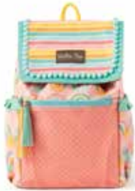
COLOR SPLASH SWIM BACKPACK *NEW!* | 31501A | OS $42