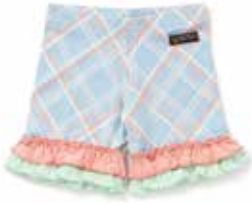
BUSY DANCING SHORTIE *NEW!* | 31218B | 2-16y $32