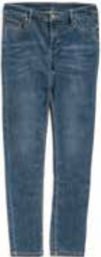
WOMEN'S MEDIUM WASH JEAN 26608B | 0-22 $88