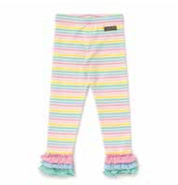
HELLO AGAIN LEGGING 31201B | 2-16y $34