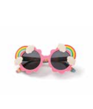
COLOR CRAZE SUNGLASSES *NEW!* | 31318A | OS $18