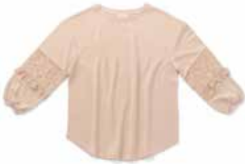
DANCING QUEEN PULLOVER *NEW!* | 31612T | XS-XXL $68