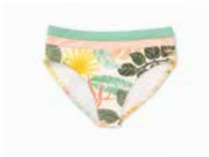
TROPICAL FLOWERS SWIMSUIT BOTTOM *NEW!* | 31672S | XS-XXL $48