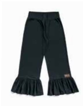
WOMEN'S CROPPED BIG RUFFLE 18652B | XS-XXL $58