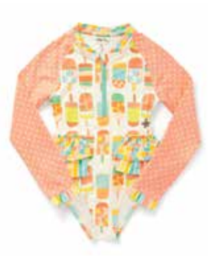
DANCING POPSICLE SWIMSUIT *NEW!* | 31SWM5S | 6-12m-16y $38