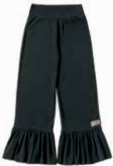
WOMEN'S BIG RUFFLE - ONYX 18608B | XS-XXL $58