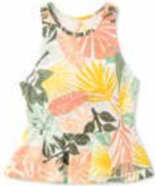
TROPICAL FLOWERS SWIMSUIT TOP *NEW!* | 31671S | XS-XXL $58