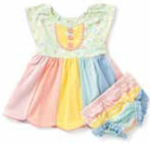
SWEET AS CAN BE DRESS *NEW!* | 31900D | NB to 18-24m $42