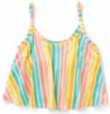
COLORFUL COAST SWIMSUIT TOP *NEW!* | 31670S | XS-XXL $58