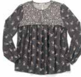
IN THE BREEZEWAY BLOUSE *NEW!* | 31610T | XS-XXL $64