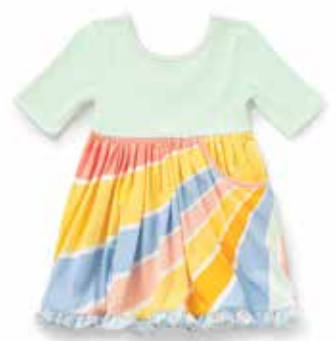
IN THE SUN DRESS *NEW!* | 31001D | 2-16y $54