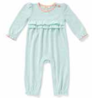
LOVING LIFE ROMPER *NEW!* | 31913R | NB to 18-24m $38