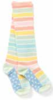
JUMP IN SOCKS *NEW!* | 31303A | S-L $16