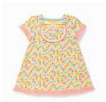
DOTS ON DOTS SWIM COVERUP *NEW!* | 31SWM7S | 2-16y $42