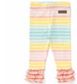
MY GIRL LEGGING *NEW!* | 31902B | NB to 18-24m $32