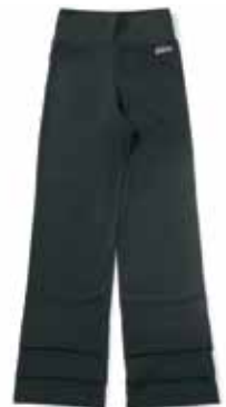
WOMEN'S TALL FINN - ONYX 24609B | XS-XXL $58