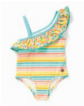
LOLLIPOP LINES SWIMSUIT *NEW!* | 31SWM3S | 6-12m-16y $42