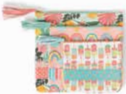
LET'S SWIM POUCH SET *NEW!* | 31502A | OS $38