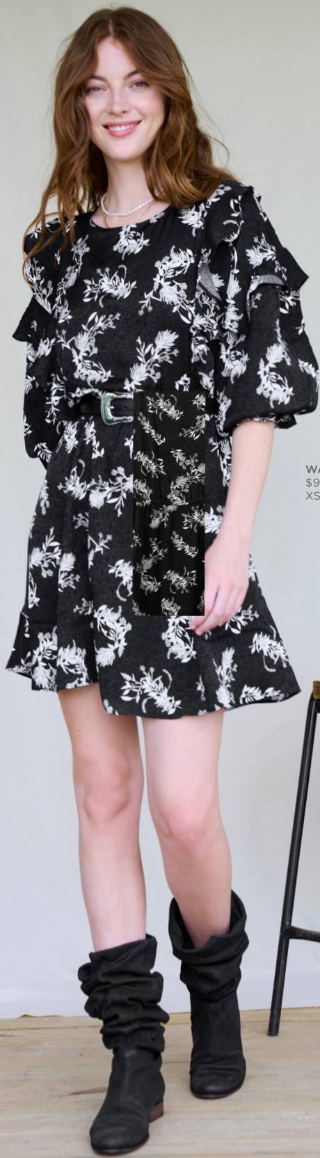
WAVERLY DRESS $98 • GH02003D XS-XXL