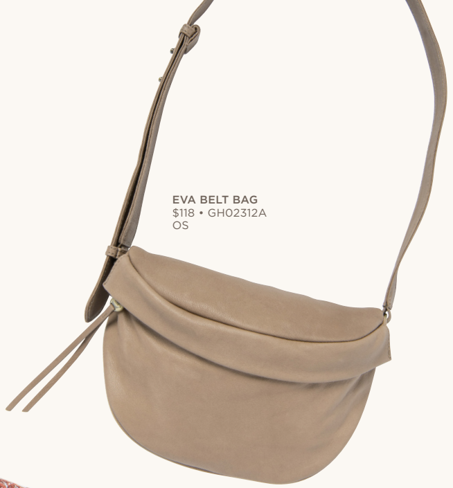
EVA BELT BAG $118 • GH02312A OS