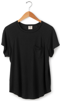
CLOVERPORT TEE, BLACK $38 • GH01131T • XS-XXL