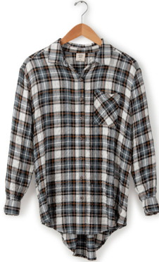
BARDSTOWN SHIRT $68 • GH02113T • XS-XXL