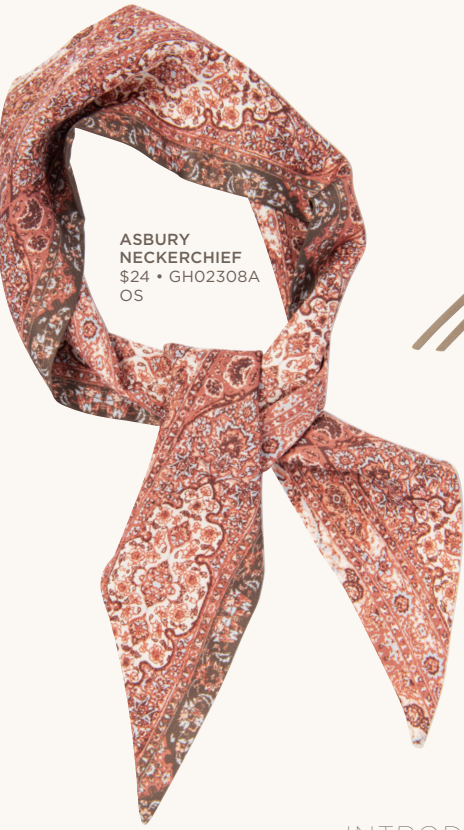
ASBURY NECKERCHIEF $24 • GH02308A OS