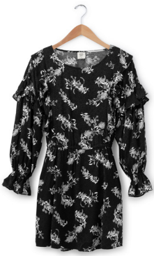
WAVERLY DRESS $98 • GH02003D • XS-XXL