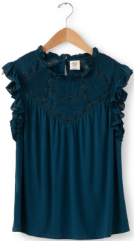
ERIN TOP $68 • GH02143T • XS-XXL