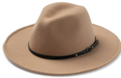
HARLAN HAT $58 • GH02305A • OS