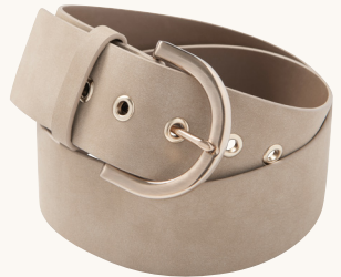
RIVES BELT $48 • GH02306A XS/S, M/L, XL/XXL