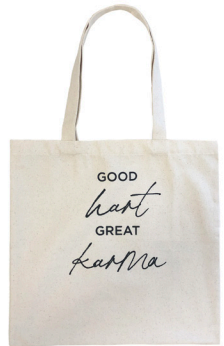
GHGK TEE & TOTE BAG SET $40 • GH02104T • XS-XXL (Tee) & OS (Tote)