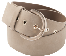
RIVES BELT $48 • GH02306A • XS/S, M/L, XL/XXL