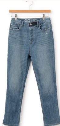
ASHLAND STRAIGHT-LEG JEAN, MEDIUM WASH $78 • GH02211B • 0-22