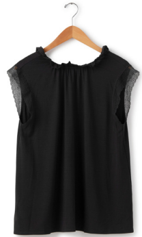
WYATT TOP, BLACK $48 • GH02170T • XS-XXL