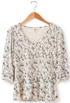
BELMONT BLOUSE $68 • GH01140T • XS-XXL