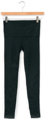
BRENTWOOD LEGGING $68 • GH00203B • XS-XXL