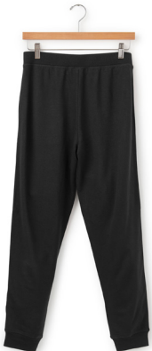
ARLINGTON JOGGER, BLACK $68 • GH02204B • XS-XXL