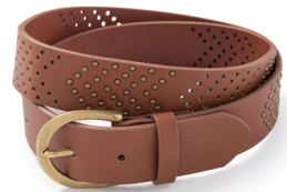
LONDON BELT $48 • GH02313A • XS/S, M/L, XL/XXL