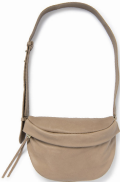
EVA BELT BAG $118 • GH02312A • OS