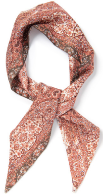
ASBURY NECKERCHIEF $24 • GH02308A • OS