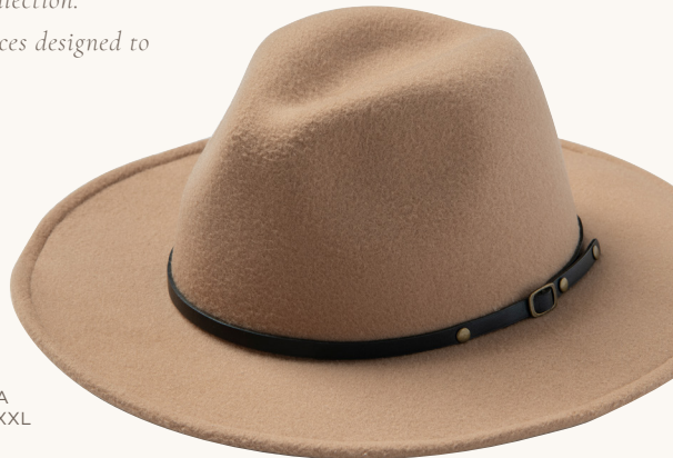
LONDON BELT $48 • GH02313A XS/S, M/L, XL/XXL