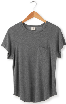
CLOVERPORT TEE, GRAY $38 • GH02140T • XS-XXL