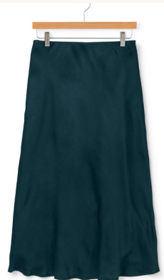
BELLE MEADE SKIRT $68 • GH02224B • XS-XXL