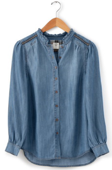
LYLES SHIRT $78 • GH02111T • XS-XXL