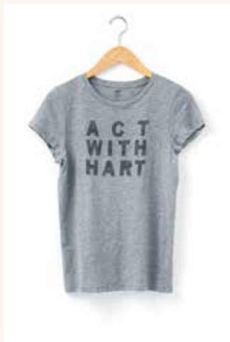
ACT WITH HART TEE $36 • GH00116T • XS-XXL