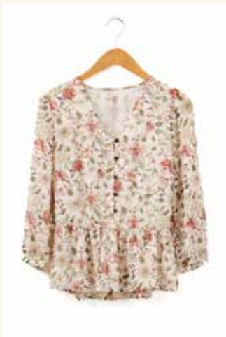
ZILKER BLOUSE $68 • GH01105T • XS-XXL