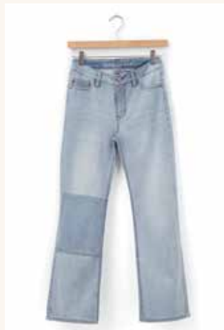
WINDSOR STRAIGHT CROP JEAN, PATCHWORK $98 • GH01210B • 0-22