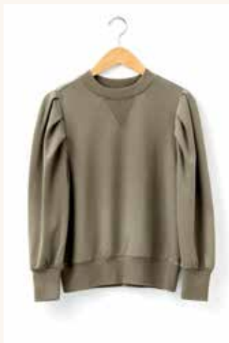
BONNELL SWEATSHIRT, SAGE GREEN $58 • GH01147T • XS-XXL