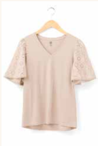
BARTON TEE $58 • GH01111T • XS-XXL