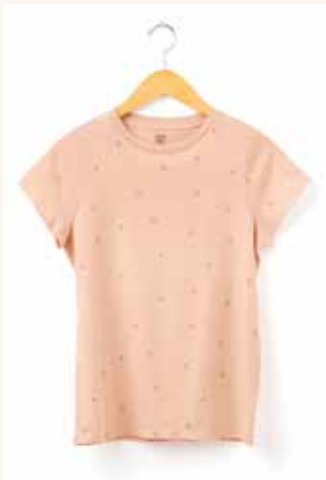
CRESTVIEW TEE $36 • GH01135T • XS-XXL