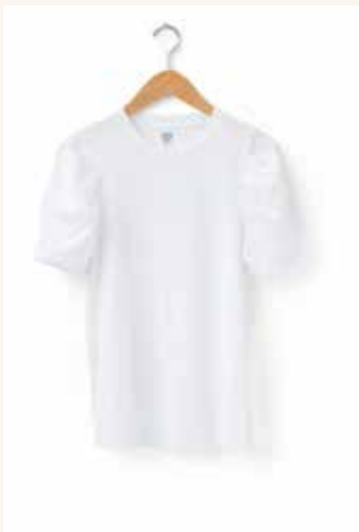
BRILEY TEE, WHITE $36 • GH00131T • XS-XXL