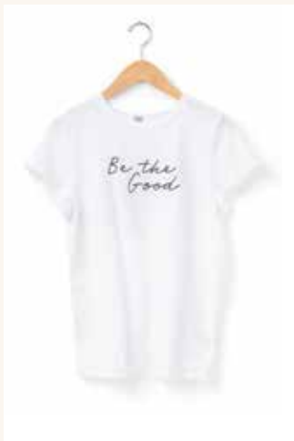
BE THE GOOD TEE $36 • GH00100T • XS-XXL