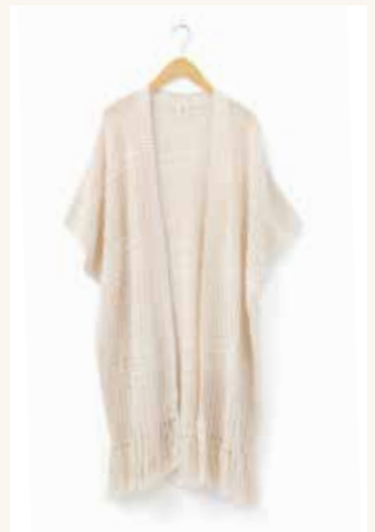
MAYFIELD SWEATER KIMONO $88 • GH01137L • XS/S-XL/XXL