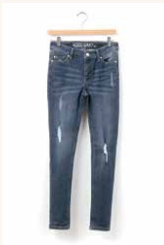
SOMMERSET SKINNY JEAN, BLUE $98 • GH00200B • 0-22