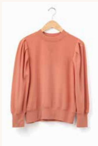
BONNELL SWEATSHIRT, CANYON CLAY $58 • GH01124T • XS-XXL