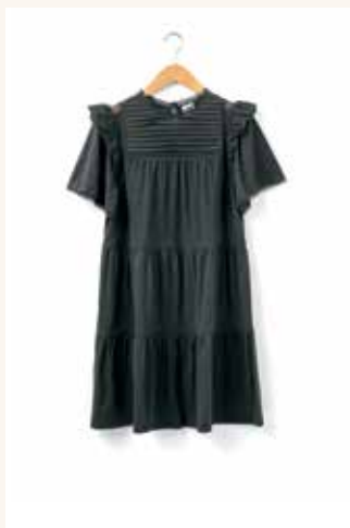
MCKINNEY DRESS $68 • GH01004D • XS-XXL