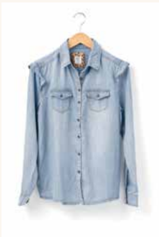
BLUEBIRD CHAMBRAY SHIRT $68 • GH00109T • XS-XXL