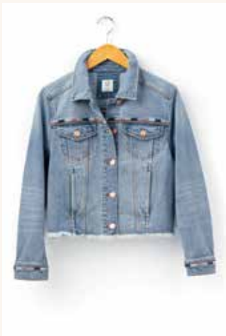
LONE STAR DENIM JACKET $98 • GH01420L • XS-XXL