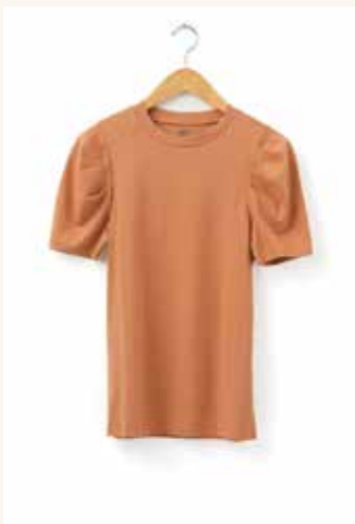
RAINEY TEE $36 • GH01145T • XS-XXL