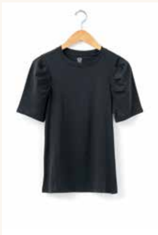
BRILEY TEE, BLACK $36 • GH00101T • XS-XXL