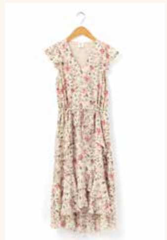
WEST LYNN DRESS $88 • GH01011D • XS-XXL