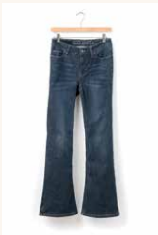
BELLE FLARE JEAN $88 • GH00201B • 0-22