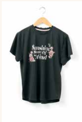
SUNSHINE STATE OF MIND TEE $36 • GH01101T • XS-XXL