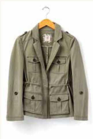
AUSTIN CARGO JACKET $98 • GH01410L • XS-XXL