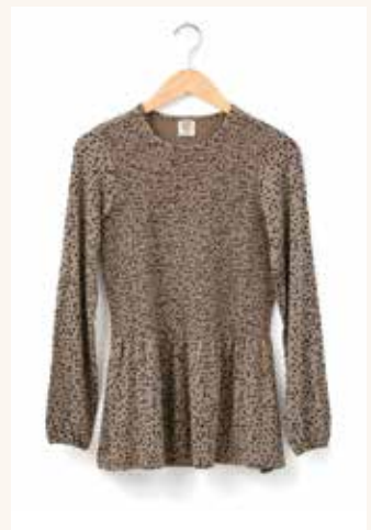
CITY LIMITS TOP $68 • GH01126T • XS-XXL