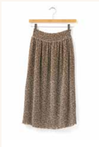
ADINA SKIRT $68 • GH01207B • XS-XXL