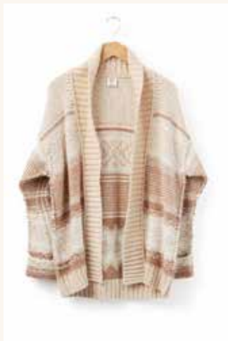
DUVAL CARDIGAN $98 • GH01113T • XS-XXL