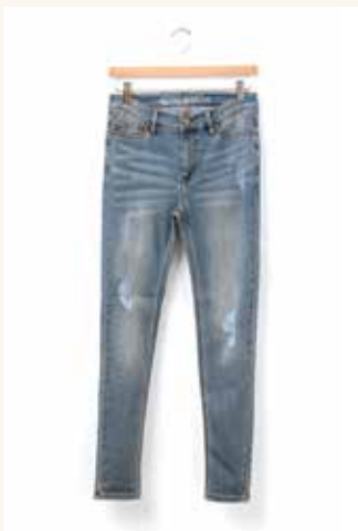
SOMMERSET SKINNY JEAN, LIGHT WASH $98 • GH01212B • 0-22