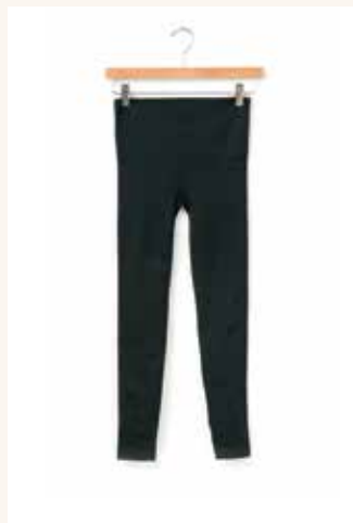
BRENTWOOD LEGGING $68 • GH00203B • XS-XXL