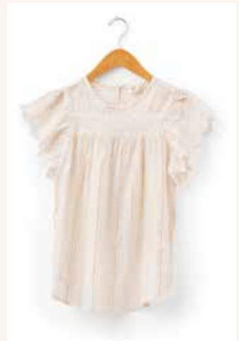
MOCKINGBIRD TOP $64 • GH01108T • XS-XXL