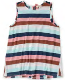
SIERRA WOMEN'S SLEEVELESS MULTI-STRIPED TIE-BACK TANK *NEW!* | 32600T | XS-XXL $54