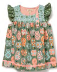
BELLA GIRLS' MIXED-PRINT RUFFLE-SLEEVE TUNIC *NEW!* | 32130T | 2-16y $38