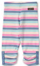
ELLIE GIRLS' STRIPED CROPPED LEGGING *NEW!* | 32242B | 2-16y $34