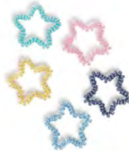
STARRY GIRLS' HAIR TIES PACK *NEW!* | 32302A | OS $12