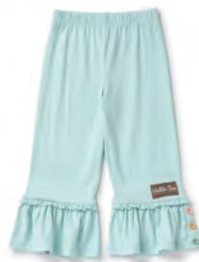
KINSELY GIRLS' BIG RUFFLE BOTTOMS *NEW!* | 32217B | 2-16y $36