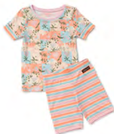
REMI GIRLS' FLORAL & STRIPED MIXED-PRINT JAMMIES *NEW!* | 32JAM9P | 2-16y $38