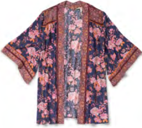
OLIVIA WOMEN'S FLORAL PRINT KIMONO *NEW!* | 32614T | XS-XXL $68