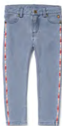
KENNEDY GIRLS' SIDE STRIPED JEGGINGS *NEW!* | 32204B | 2-16y $44