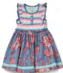
LIBBY GIRLS' STRIPED & FLORAL MIXED-PRINT DRESS *NEW!* | 32002D | 2-16y $58