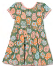
CECE GIRLS' APPLE PRINT FULL SKIRT DRESS *NEW!* | 32001D | 2-16y $44