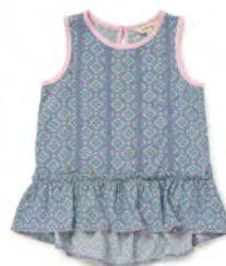
ABBIE GIRLS' RUFFLE FLOUNCE SLEEVELESS TUNIC *NEW!* | 32103T | 2-16y $38