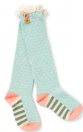
MALENA GIRLS' MIXED-PRINT RUFFLED SOCKS *NEW!* | 32321A | S-M-L $16