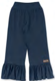
SOFIA WOMEN'S BIG RUFFLE NAVY PANTS *NEW!* | 32616B | XS-XXL $58