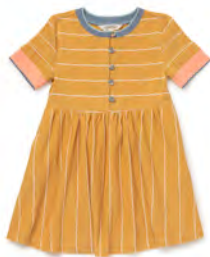
AMAYA GIRLS' STRIPED WAFFLE DRESS *NEW!* | 32033D | 2-16y $44