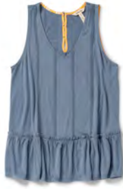
HALLE WOMEN'S SLEEVELESS RUFFLED-HEM TANK *NEW!* | 32601T | XS-XXL $54