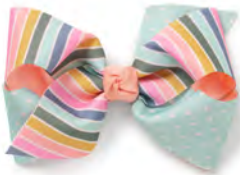
MIKO GIRLS' STRIPE & POLKA DOT HAIRBOW *NEW!* | 32320A | OS $14