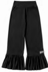
SOFIA WOMEN'S BIG RUFFLE ONYX PANTS 18608B | XS-XXL $58