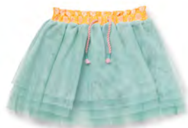
MISTY GIRLS' MULTI-LAYERED TULLE SKIRT *NEW!* | 32202B | 2-16y $44