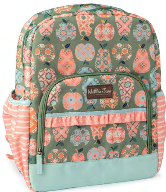
CECE APPLE PRINT BACKPACK 32801A | OS $68 or $30 (WITH A $175+ PURCHASE)