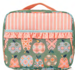
CECE APPLE PRINT LUNCH BOX *NEW!* | 32502A | OS $30