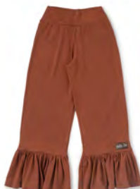
SOFIA WOMEN'S BIG RUFFLE MOCHA PANTS *NEW!* | 32604B | XS-XXL $58