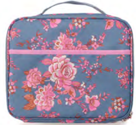
HARLOW FLORAL & POLKA DOT PRINT LUNCH BOX *NEW!* | 32503A | OS $30