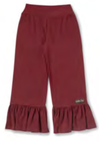
SOFIA WOMEN'S BIG RUFFLE BURGUNDY PANTS *NEW!* | 32617B | XS-XXL $58