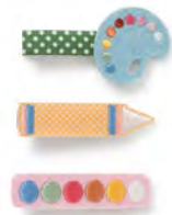
AINSLIE ARTSY GIRLS' HAIRCLIP TRIO *NEW!* | 32301A | OS $14