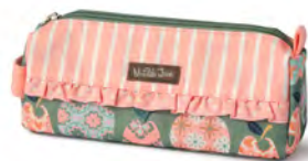
CECE APPLE PRINT PENCIL CASE *NEW!* | 32500A | OS $18