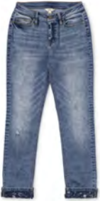
TAYLOR WOMEN'S STRAIGHT LEG FLORAL CUFF JEAN *NEW!* | 32618B | 0-22 $88