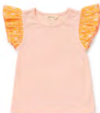
RILEY GIRLS' PLEATED-SLEEVE TOP *NEW!* | 32102T | 2-16y $30