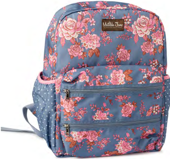
HARLOW FLORAL & POLKA DOT PRINT BACKPACK 32802A | OS $68 or $30 (WITH A $175+ PURCHASE)