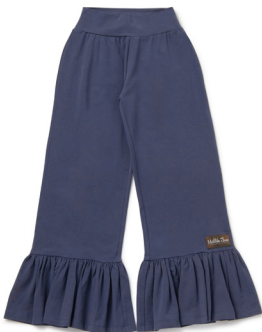
WOMEN'S BIG RUFFLE - VINTAGE BLUE *NEW!* | 31649B | XS-XXL $58