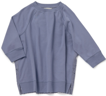
IN THE MOMENT SWEATSHIRT *NEW!* | 31689T | XS-XXL $68