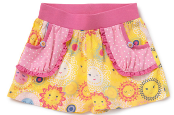
LITTLE MISS SUNSHINE SHORT *NEW!* | 31227B | 2-16y $34