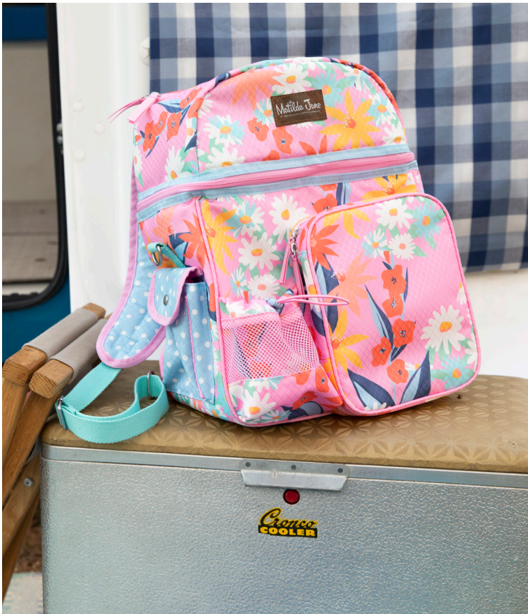
EVERYTHING PACKED PROMO COOLER BACKPACK *NEW!* | 31803A | OS