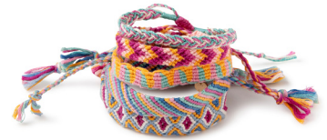
FRIENDS FOREVER BRACELET SET *NEW!* | 31317A | OS $16