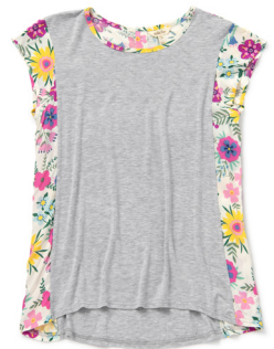
BE YOURSELF TOP *NEW!* | 31641T | XS-XXL $54