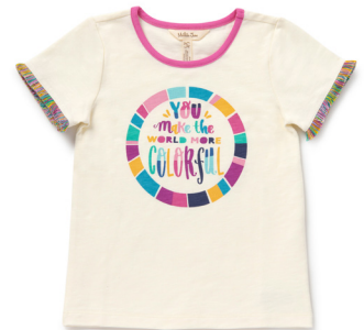
COLORFUL WORLD TEE *NEW!* | 31139T | 2-16y $34