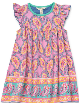
PAISLEY PLEASE DRESS *NEW!* | 31025D | 2-16y $44