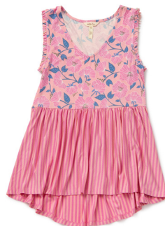
OFF SHE GOES TOP *NEW!* | 31642T | XS-XXL $48