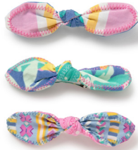
ON AND ON BOW CLIP SET *NEW!* | 31325A | OS $16