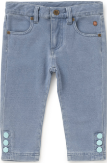
CROPPED TAB JEGGING *NEW!* | 31229B | 2-16y $40