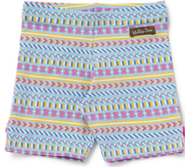
TIME TO COLOR SHORTIE *NEW!* | 31214B | 2-16y $32