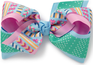
LIFE IN COLOR BOW *NEW!* | 31311A | OS $14