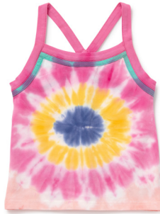
LET'S TIE DYE TANK TOP *NEW!* | 31126T | 2-16y $28