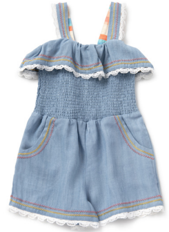
PICNIC IN THE PARK ROMPER *NEW!* | 31015R | 2-16y $44