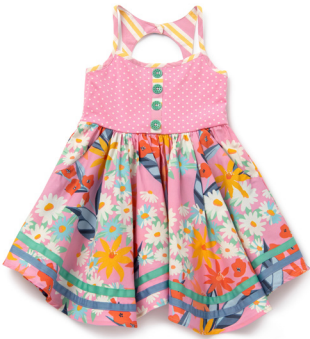
SUNNY AFTERNOON DRESS *NEW!* | 31028D | 2-16y $48