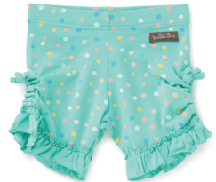
SPRINKLE CANDY SHORTIE 31211B | 2-16y $32