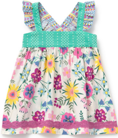
FLORAL IMAGINATION TUNIC *NEW!* | 31129T | 2-16y $42