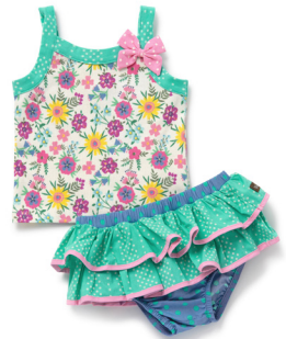
RUFFLE DAISY SET *NEW!* | 31911C | NB-24M $38