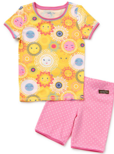
NAP IN THE SUN PJ SET *NEW!* | 31JAM8P | 6M-16 $38