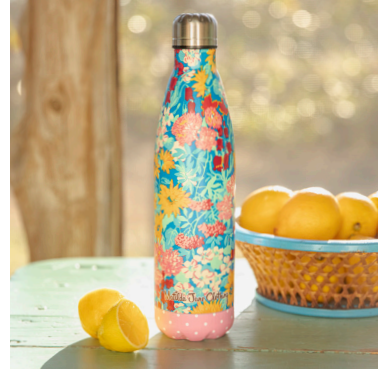
FLORAL SCENE CANTEEN *NEW!* | 31805A | OS $28