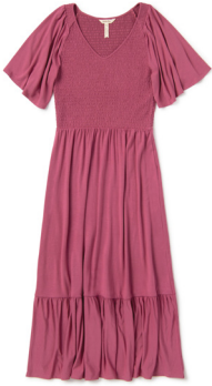
GOOD DAYS DRESS *NEW!* | 31646D | XS-XXL $78