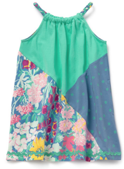
POLKA DOT DAISY DRESS *NEW!* | 31026D | 2-16y $48