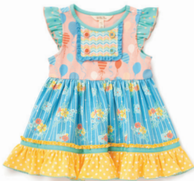
BALLOON PLAY TUNIC 31142T | 2-16y $42