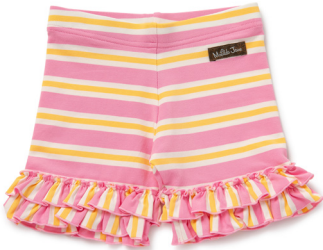
STRIPE PLAY SHORTIE *NEW!* | 31213B | 2-16y $32