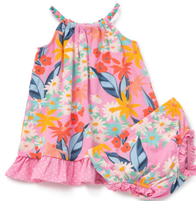
FLORAL DAY DRESS *NEW!* | 31918D | NB-24M $42