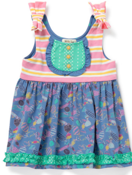
SUGARY AND SWEET TUNIC *NEW!* | 31114T | 2-16y $42