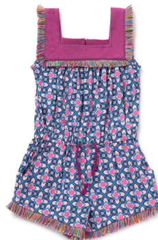
RAINBOW FRINGE ROMPER *NEW!* | 31018R | 2-16y $44