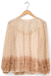
BONNEAU BLOUSE $78 • GH02131T • XS-XXL