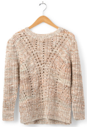
MONETTA SWEATER $88 • GH02245T • XS-XXL