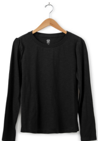
LAREDO LONG SLEEVE TEE $38 • GH02180T • XS-XXL