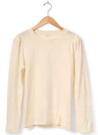
SELMA TEE $38 • GH02182T • XS-XXL