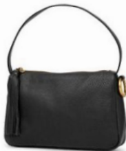
WHITNEY BAG $178 • GH02803A • OS