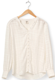
CHARLESTON BLOUSE $78 • GH02124T • XS-XXL