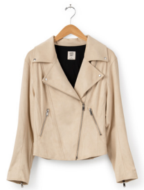
LANDRUM JACKET $128 • GH02452L • XS-XXL