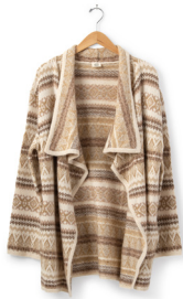
DEVEAUX BANK SWEATER JACKET $108 • GH02411L • XS-XXL