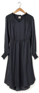
BEAUFORT DRESS $98 • GH02010D • XS-XXL