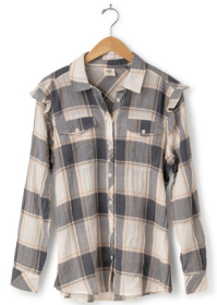
NEWBERRY BUTTON-UP $68 • GH02151T • XS-XXL