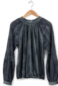
ABBEVILLE TOP $78 • GH02136T • XS-XXL