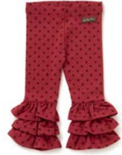
VIVVIE BENNY *NEW!* | 32921B | 0-24M $28