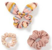
TAMAR SCRUNCHIE PACK *NEW!* | 32315A | OS $14