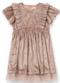
KORI DRESS *NEW!* | 32073D | 2-16y $54