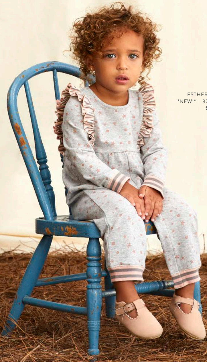
ESTHER ROMPER *NEW!* | 32922R | 0-24M $42