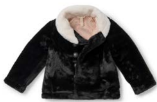
ARTIS COAT *NEW!* | 32149T | 2-16y $88