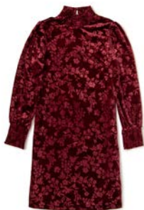
MELANIE DRESS *NEW!* | 32695D | XS-XXL $88