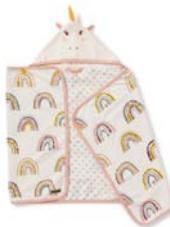
SPARKLEBERRY TOWEL *NEW!* | 32520A | OS $44