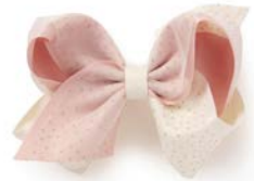
AYALA HAIRBOW *NEW!* | 32324A | OS $14