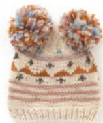
ADELE WINTER HAT *NEW!* | 32330A | S-M-L $24