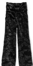
MARNIE PANTS *NEW!* | 32230B | 2-16y $44