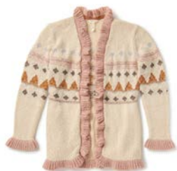
JACIE CARDIGAN *NEW!* | 32653T | XS-XXL $98