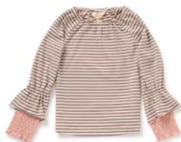
CHARLEA TOP *NEW!* | 32175T | 2-16y $38