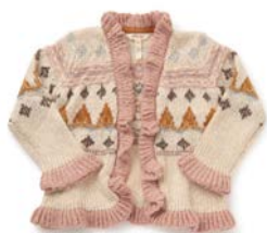
STEFANIE CARDIGAN *NEW!* | 32122T | 2-16y $68