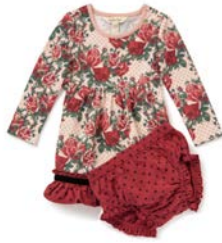
SHOSHANA DRESS *NEW!* | 32920D | 0-24M $42