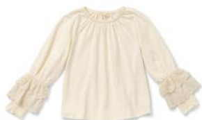
TILLY TOP *NEW!* | 32179T | 2-16y $38