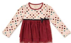
RONNIE TOP *NEW!* | 32173T | 2-16y $44