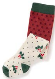
HILA TIGHTS *NEW!* | 32323A | 6M - 16y $18