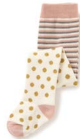
RUTHI TIGHTS *NEW!* | 32329A | 6M - 16y $18