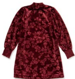
ORIANNA DRESS *NEW!* | 32016D | 2-16y $58