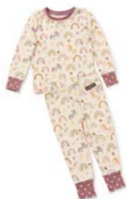
SUTTON JAMMIES *NEW!* | 32JAM14P | 6M-16y $38