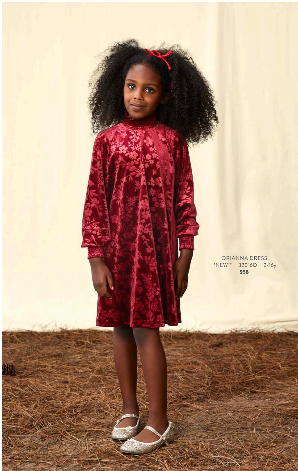
ORIANNA DRESS *NEW!* | 32016D | 2-16y $58