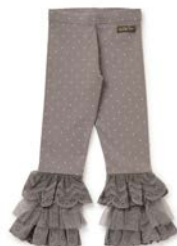
EDIE BENNY *NEW!* | 32229B | 2-16y $38