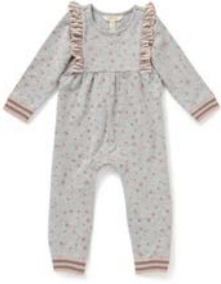
ESTHER ROMPER *NEW!* | 32922R | 0-24M $42