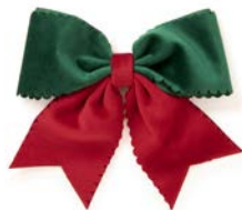
NOA HAIRBOW *NEW!* | 32314A | OS $14