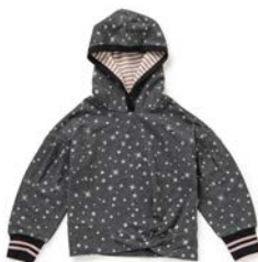
BRIGIDA HOODIE *NEW!* | 32129T | 2-16y $48