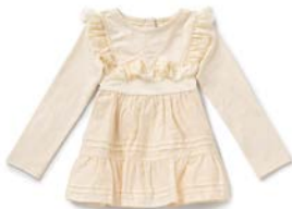
EMERSON TOP *NEW!* | 32120T | 2-16y $46