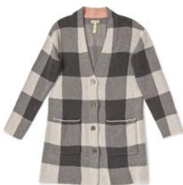
ENOLA SWEATER JACKET *NEW!* | 32661T | XS-XXL $98