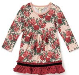
KENSLEY DRESS *NEW!* | 32038D | 2-16y $54