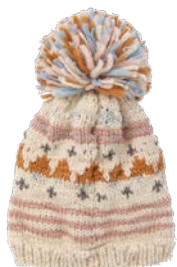
ROMI WINTER HAT *NEW!* | 32660A | OS $34