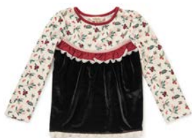
LUCIE TOP *NEW!* | 32146T | 2-16y $44