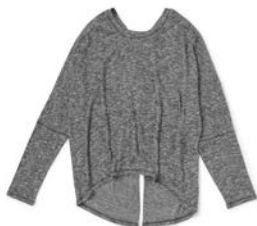
KAYA TUNIC *NEW!* | 32681T | XS-XXL $58