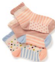
ALEEN SOCK PACK *NEW!* | 32334A | S-M-L $18