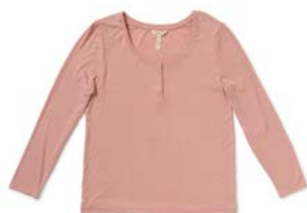
RYANNE HENLEY *NEW!* | 32694T | XS-XXL $48