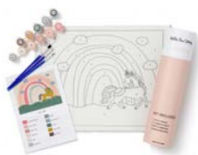
SKYDANCER UNICORN PAINT-BY-NUMBERS SET *NEW!* | 32540A | OS $28