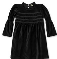
ANDI DRESS *NEW!* | 32061D | 2-16y $58