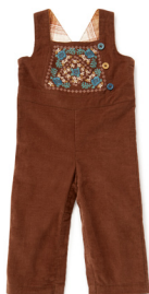
KIMBERLY BABIES' OVERALL *NEW!* | 32916R | 0-24M $44