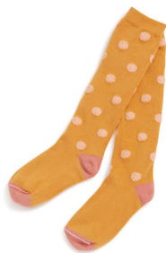
DANA GIRLS' KNEE-HIGHS *NEW!* | 32316A | S-M-L $16