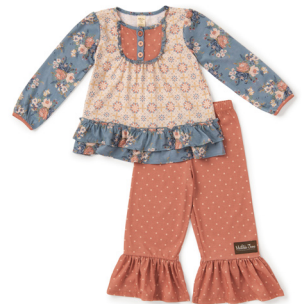
CELINA GIRLS' BIG RUFFLE PJS *NEW!* | 32JAM5P | 2-16y $46