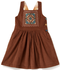
ARYA GIRLS' JUMPER DRESS *NEW!* | 32067D | 2-16y $58