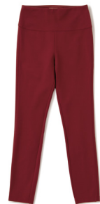
PONTE WONDER LEGGING, BURGUNDY *NEW!* | 32656B | XS-XXL $68