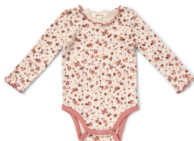
LENNIE BABIES' ONESIE *NEW!* | 32951O | 0-24M $22