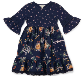
CALLISTA GIRLS' DRESS 32029D | 2-16y $58