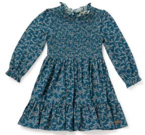
ZOEY GIRLS' DRESS *NEW!* | 32065D | 2-16y $54