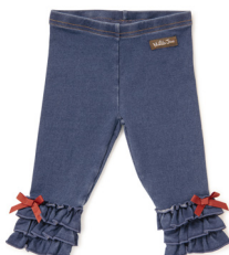
TESS BABIES' JEGGING *NEW!* | 32915B | 0-24M $28