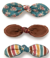
SHAN HAIRCLIPS SET *NEW!* | 32311A | OS $16