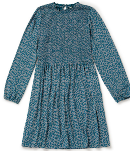
AUDRA WOMEN'S DRESS *NEW!* | 3269D1 | XS-XXL $88