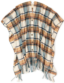
PAIGE WOMEN'S RUANA *NEW!* | 32692T | OS $78