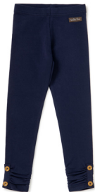
SLOAN GIRLS' LEGGING, NAVY 32270B | 2-16y $34