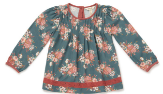
AFINA GIRLS' TOP *NEW!* | 32172T | 2-16y $42