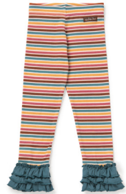
CASSIE GIRLS' LEGGING *NEW!* | 32254B | 2-16y $34