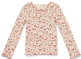
IZELLE GIRLS' TOP *NEW!* | 32148T | 2-16y $34