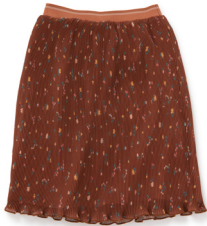
WINNIE GIRLS' SKIRT *NEW!* | 32275B | 2-16y $48