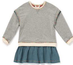
MILA GIRLS' SWEATSHIRT DRESS *NEW!* | 32071D | 2-16y $54