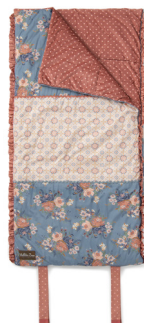
JUNO SLEEPING BAG *NEW!* | 32806A | OS $98