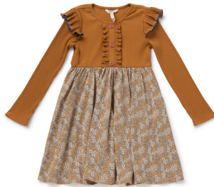
CLIO GIRLS' DRESS 320046D | 2-16y $54