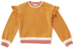
JOJO GIRLS' SWEATSHIRT *NEW!* | 32145T | 2-16y $48