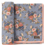
MISCHA SWADDLE *NEW!* | 32960O | OS $22