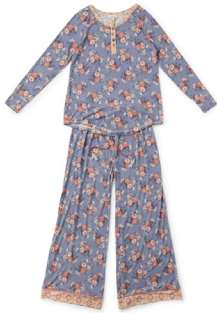
BETH WOMEN'S PJS *NEW!* | 32637P | XS-XXL $78