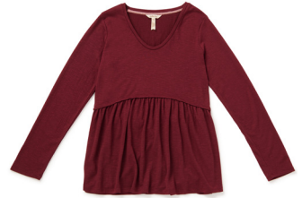
ALISA WOMEN'S TOP *NEW!* | 3269T2 | XS-XXL $58