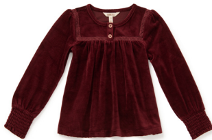
BRONWYN GIRLS' VELOUR TOP *NEW!* | 32171T | 2-16y $42