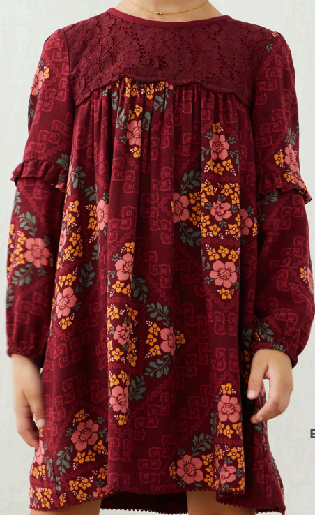
EMMALINE GIRLS' DRESS *NEW!* | 32039D | 2-16y $58