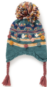
HANNI GIRLS' KNIT HAT *NEW!* | 32318A | S-M-L $24