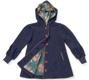
MALINA GIRLS' JACKET *NEW!* | 32139T | 2-16y $78