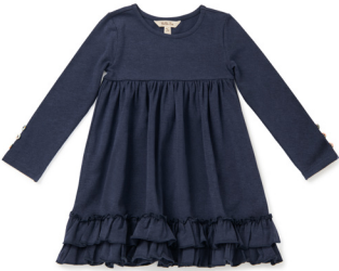
EVERLY GIRLS' DRESS *NEW!* | 32072D | 2-16y $48