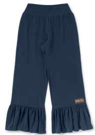
SOFIA WOMEN'S BIG RUFFLE NAVY PANTS 32616B | XS-XXL $58