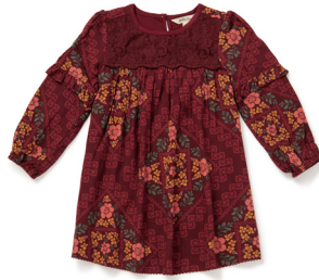
EMMALINE GIRLS' DRESS *NEW!* | 32039D | 2-16y $58