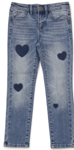
MARILEE GIRLS' JEANS *NEW!* | 32235B | 2-16y $48