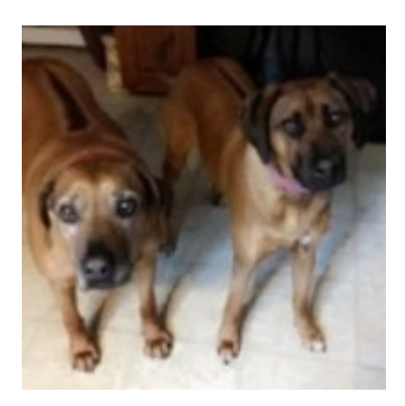
LUPO and SIENA