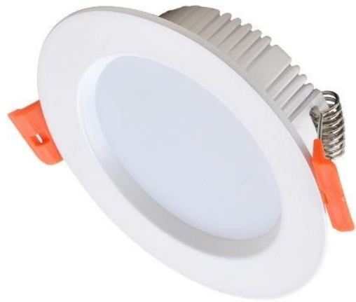
LED Downlight 180 LM/W