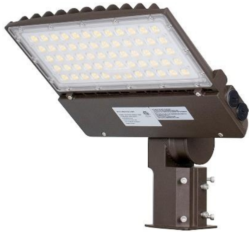
LED Parking Lot Light