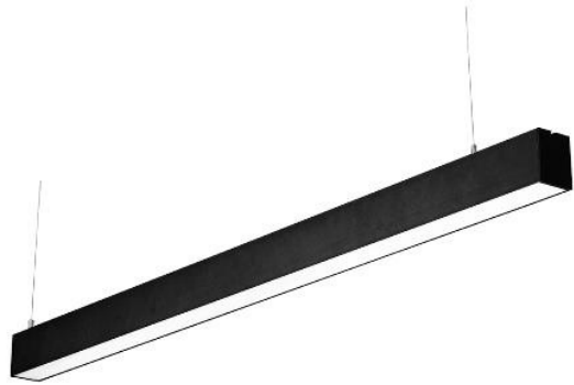
LED Linear Light