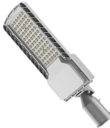
LED Street Light