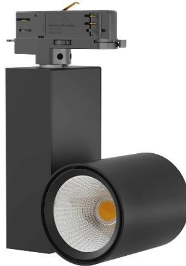
Dali DT8 LED Downlight