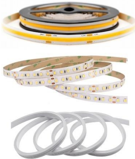
LED Strip Light