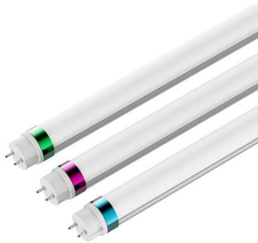
T5/T8 LED Tube Light 200 LM/W