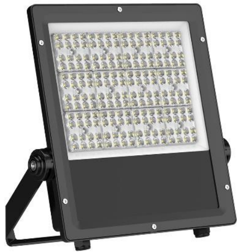
LED Flood Light