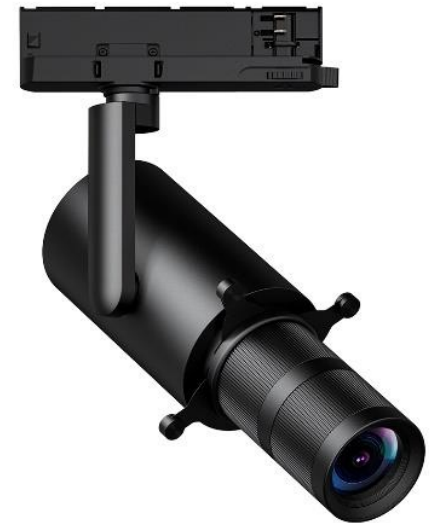
Shapeable LED Track Light