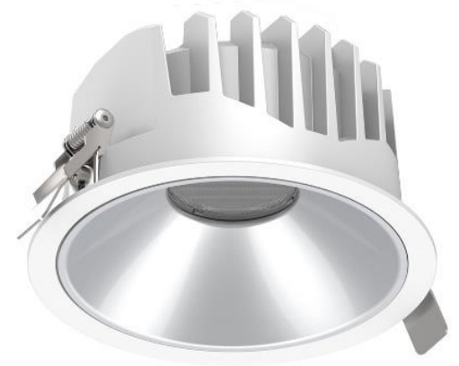
DMX RGBW Track Light