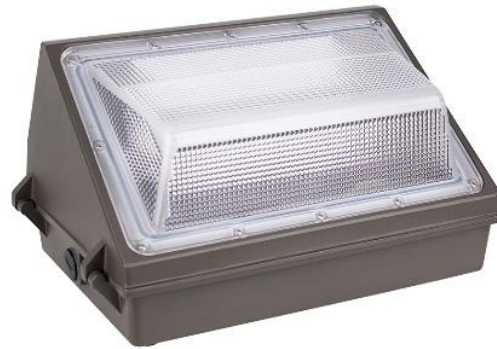
LED Wall Pack