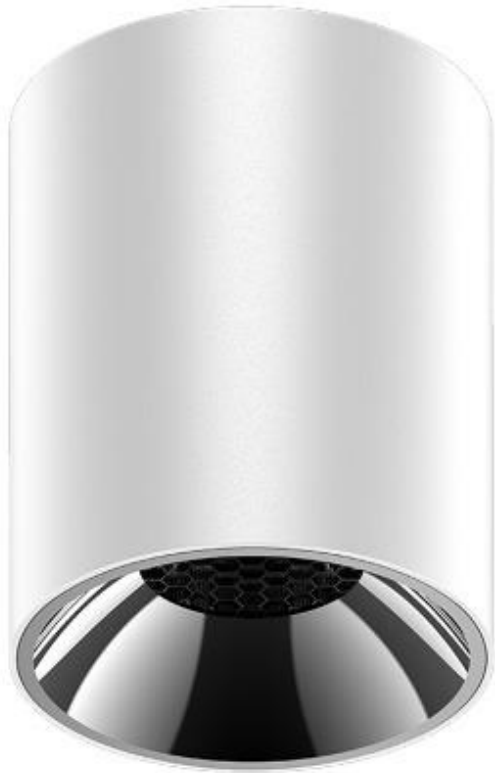
Surface LED Downlight