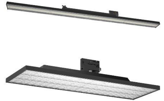
LED Linear Track Light