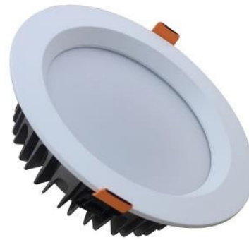
SMD LED Downlight