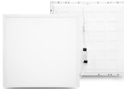
LED Panel Light 200 LM/W