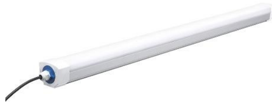
IP65 LED Tri-proof Light 180 LM/W