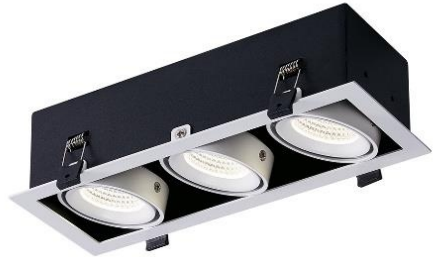
LED Grille Downlight