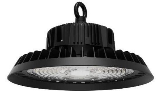
LED High Bay Light 200 LM/W