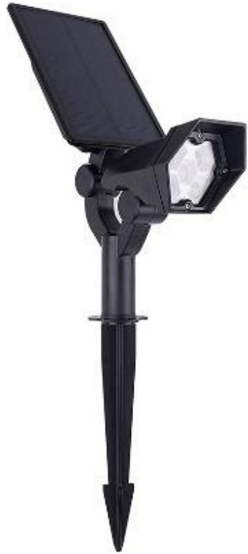
Pole Adapters & Brackets