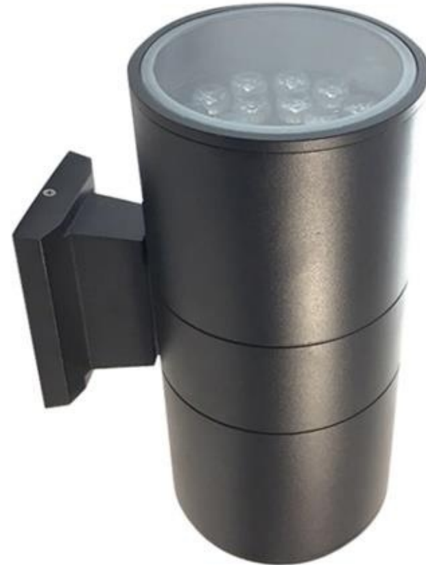
Solar LED Garden Light