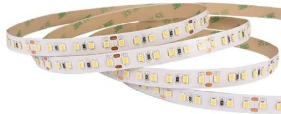
SMD LED Strip Light