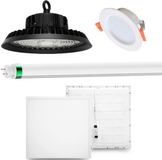
Ultra Efficient Lighting