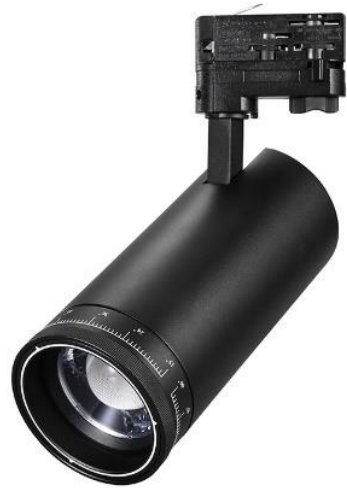
Dali Zoomable Track Light