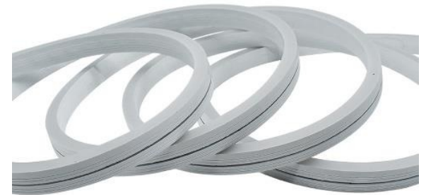
Neon LED Strip Light