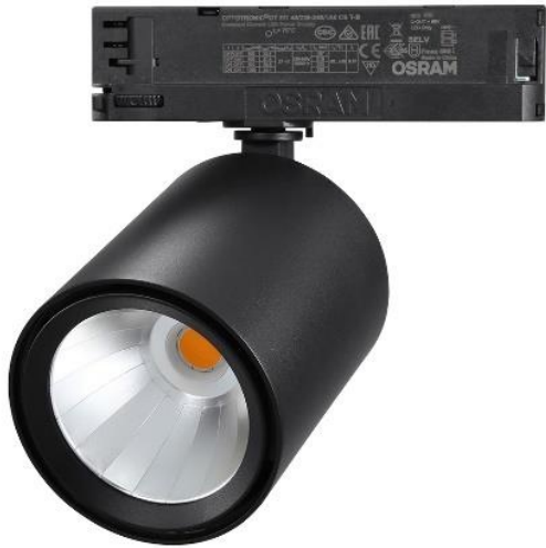
LED Track Light