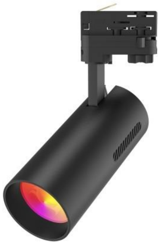
Tuya RGBW Track Light