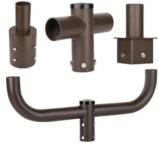
LED Wall Light