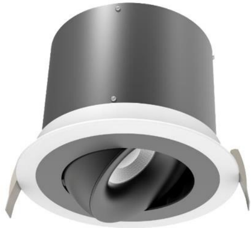
Motorized LED Downlight