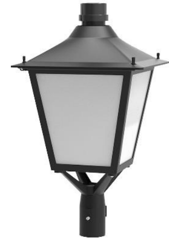
LED Post Top Light