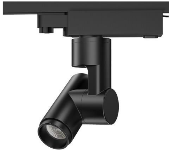
Motorized LED Track Light