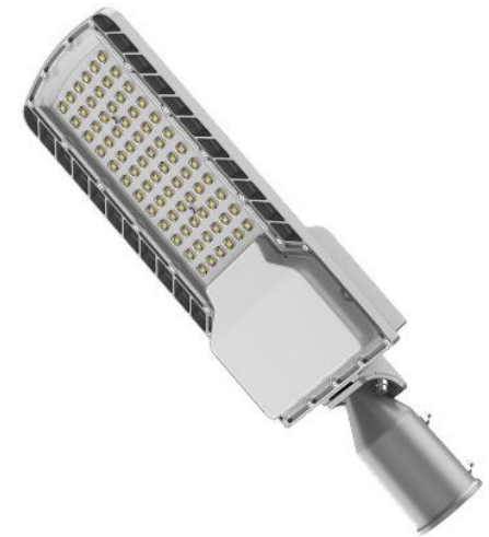
LED Street Light 180 LM/W