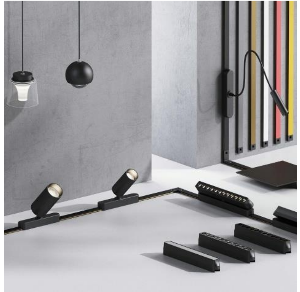
Tuya Magnetic Track Light