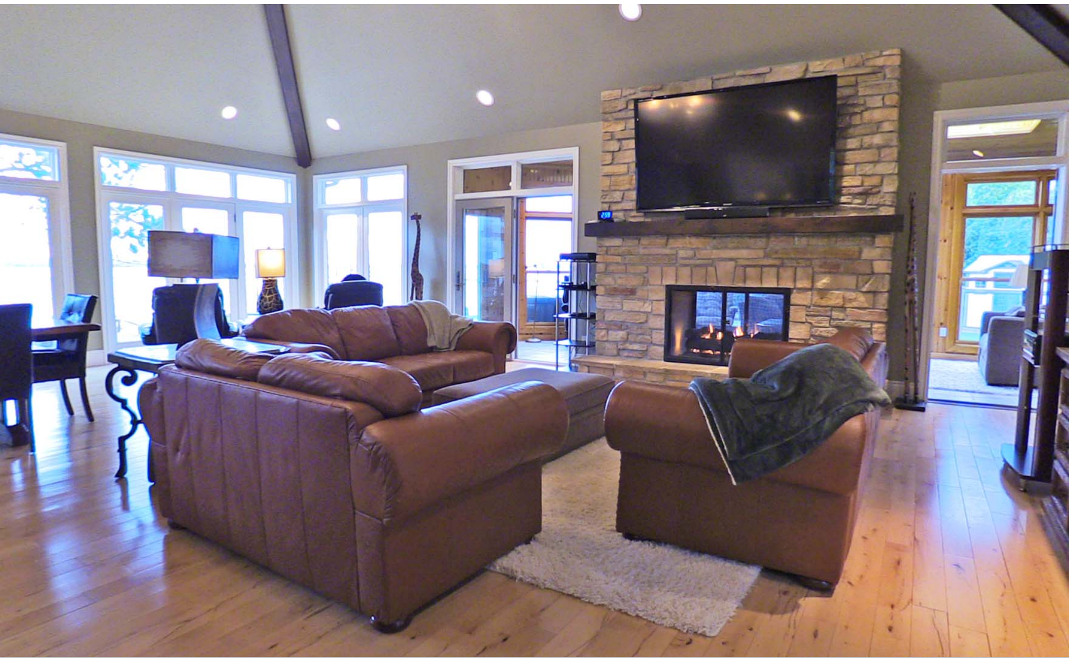
Stunning Great Room