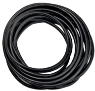
21 FT Power Cord No Strain Relief PN: 110059546