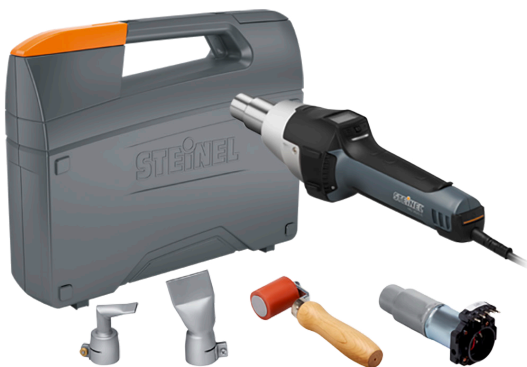
Roofing Kit PN: 110053227