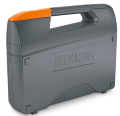
Heavy Duty Case for 20s Series Tools PN: 110036523