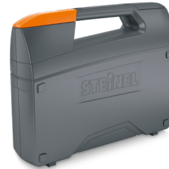
Heavy Duty Case for 20s Series Tools PN: 110036523