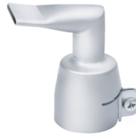
Flat Angled Nozzle 20x2 mm, 100° PN: 106934900