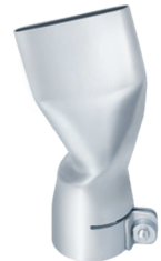
Flat Angled Nozzle 40x2 mm PN: 110049712