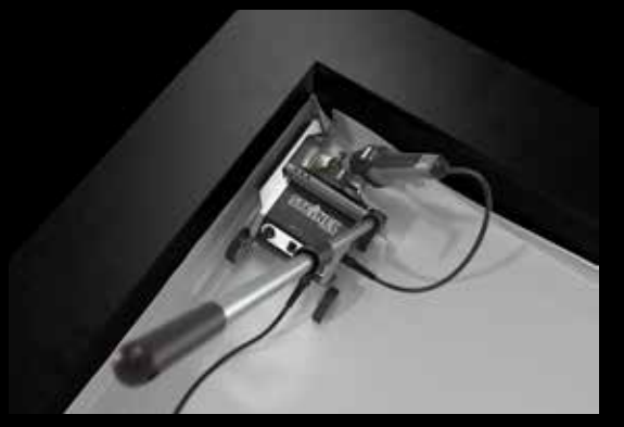
Welding as close as 8 cm to the edge on straight sides.

The new, compact and extremely user-friendly HG Roof one-man automatic welding machine produces perfectly sealed roof surfaces with its 2000 W hot air tool, high pressing force and welding width of up to 40 mm. The machine provides the capability of welding close to the edge as well as automatic welding as close as 15 cm to parapet corners. This minimises manual finishing work. Speed is infinitely variable. The handle can be moved to the left and right, enabling the automatic welding machine to travel forwards and backwards.