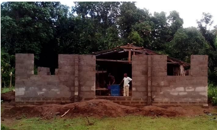
New church in Marangu. More has been completed since this photo