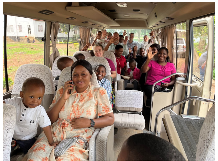
Ready for a shopping trip in new bus