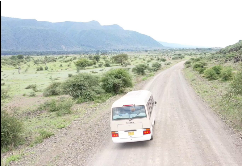
Riding our bus into the Rift Valley