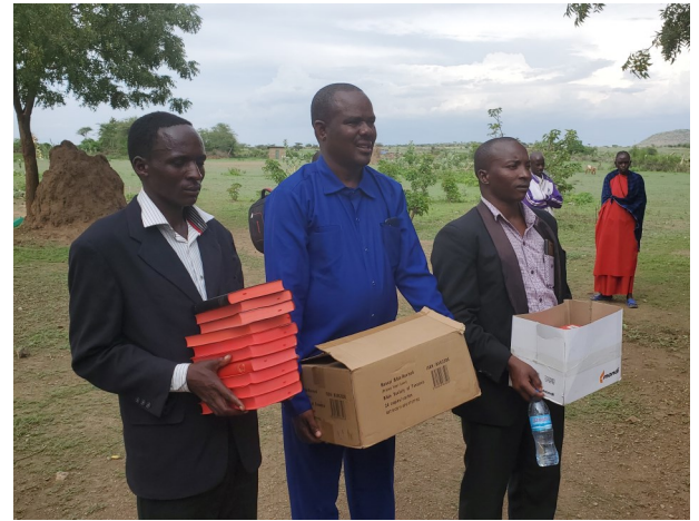
Pastors received new Maasai Bibles in the Rift Valley