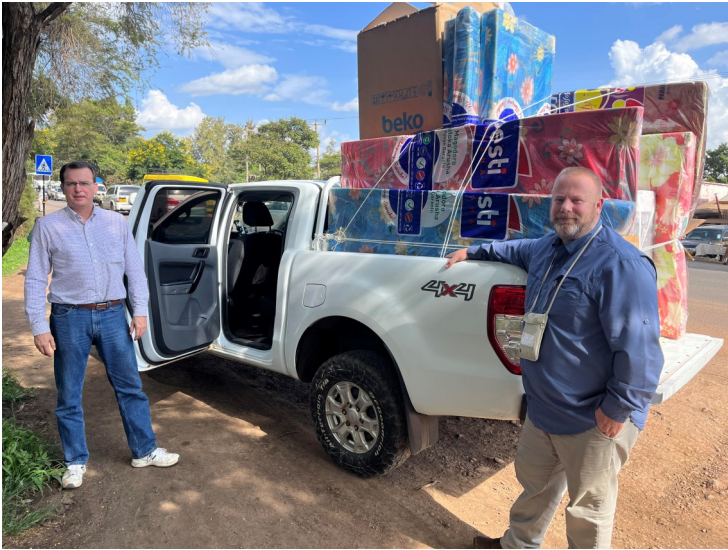
Returning from Arusha with new fridge, stove and mattresses. They didn't think we would get it all in.