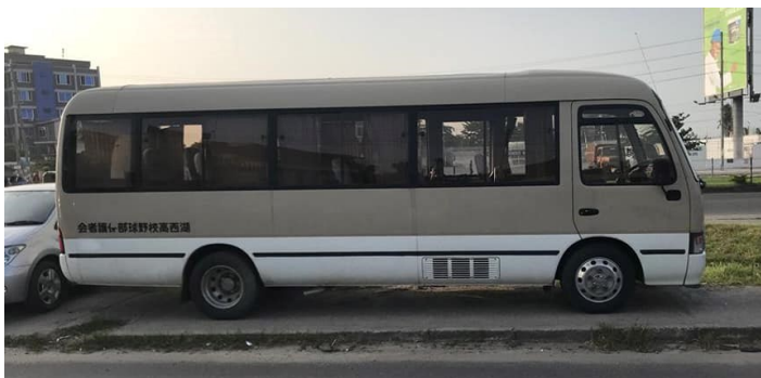
Our new bus