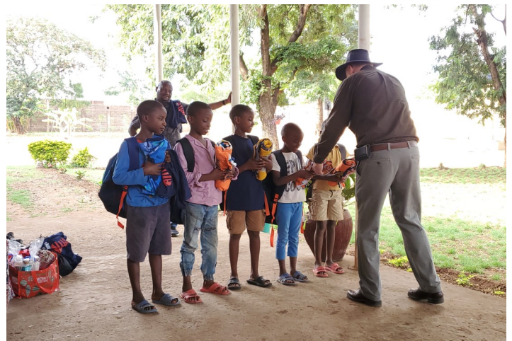
The children receiving new pajamas