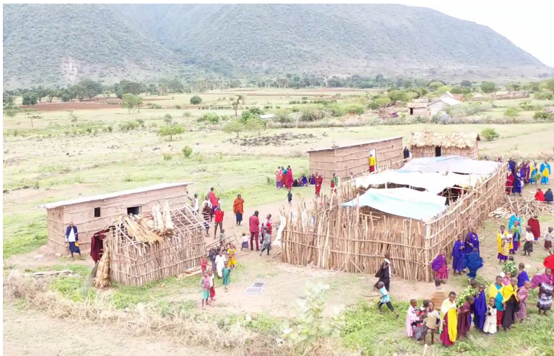
Church where Brother Woods preached on Sunday afternoon. Church roof is sheets of plastic. Ngoro Ngoro Crater is in the background.