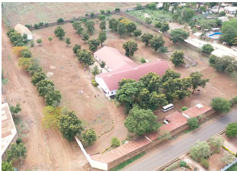
Here is a bird's eye view of the orphanage taken by Brother Bobby's drone. The orphanage is in the center; entrance is in the lower left hand corner; church is in far corner; apartments and fu- ture conference rooms and offices are along the near wall.