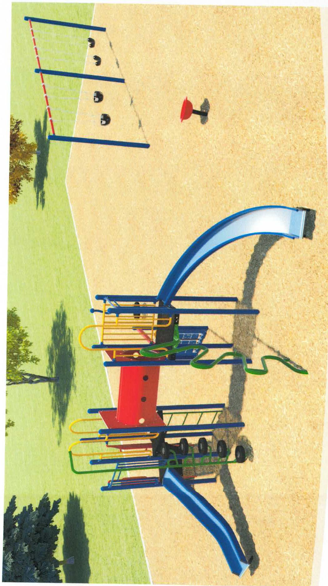
Tobique First Nation layout # A08485-C1 | J07011