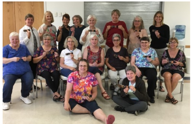
Beading Day Two