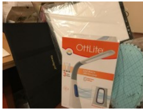
Some of September Doohickey prizes!