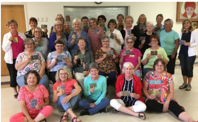
Beading Day One