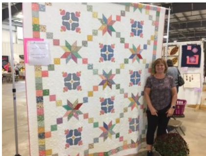
RAFFLE QUILT TICKET SALES