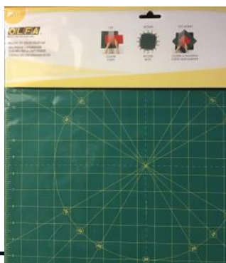
The November doohickey is an OLFA 17x17 rotating self-healing cutting mat!