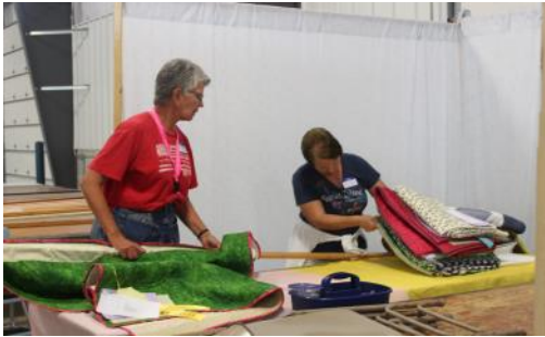
Set-up for quilt hanging