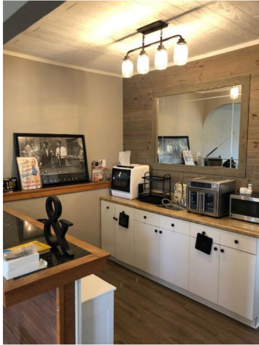
Mini-dishwasher, toaster oven, microwave...plenty of cabinet storage space.