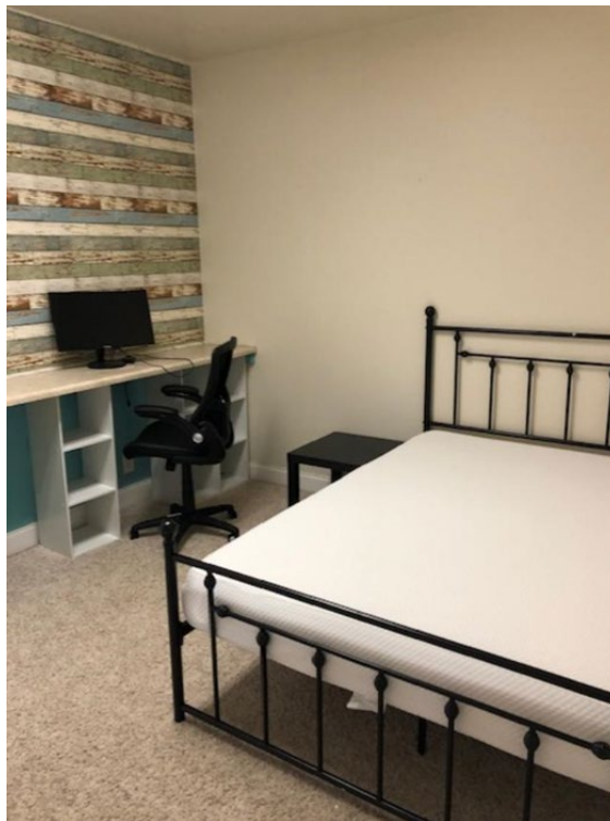
Sleeping accommodation with full closet.