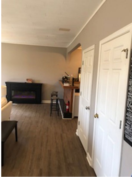
Electric Fireplace and bar/efficiency kitchen.