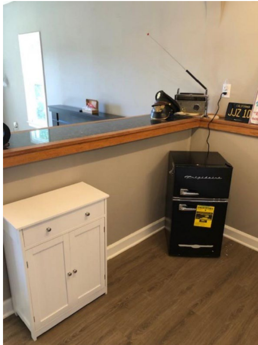
New mini fridge and storage.