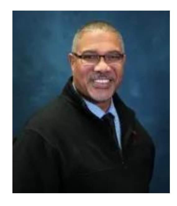
Assistant Principal 6th grade A-L + 8th grade