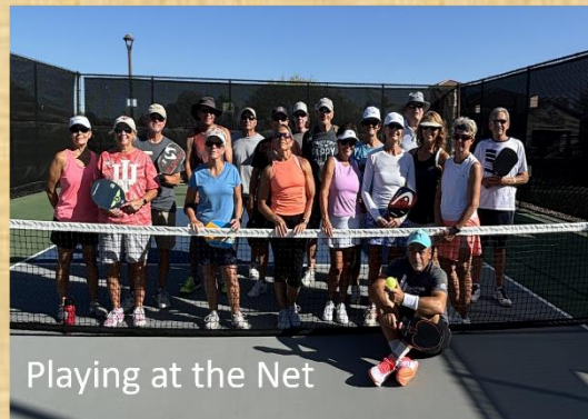
Playing at the Net