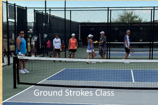
Ground Strokes Class