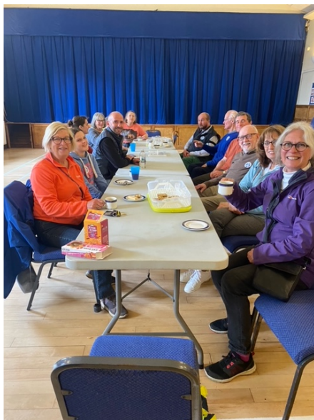
A WELL EARNED CUPPA