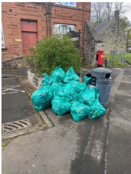
ALL GATHERED IN