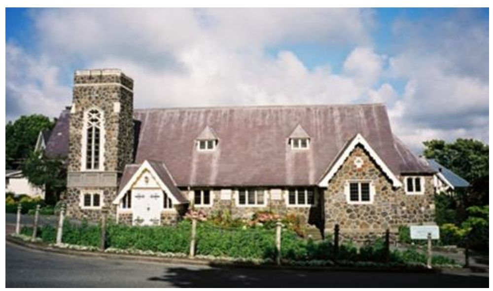
CASHMERE HILLS PRESBYTERY CHURCH

When I visit Christchurch, New Zealand I like to attend this beautiful little church, the Cashmere Hills Presbyterian Church. It is only minutes from my daughters home and I go as often as I can. That can be difficult as the service starts at 10am! It was built about 1927 in The Arts and Craft style. It holds about 200 members of the congregation, so it isn't large.