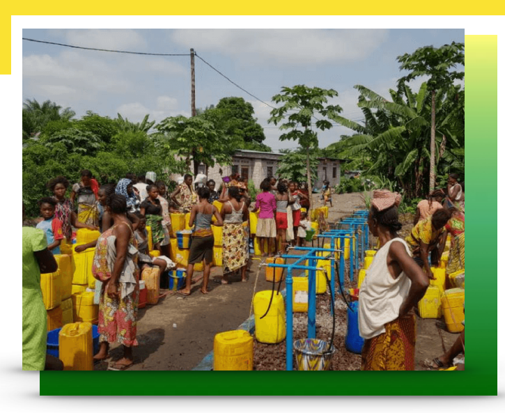
Water Supply Project