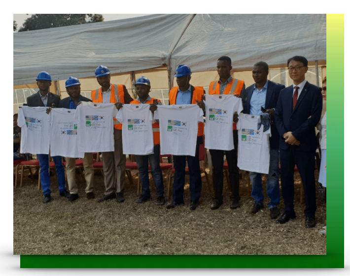
Road Construction Project