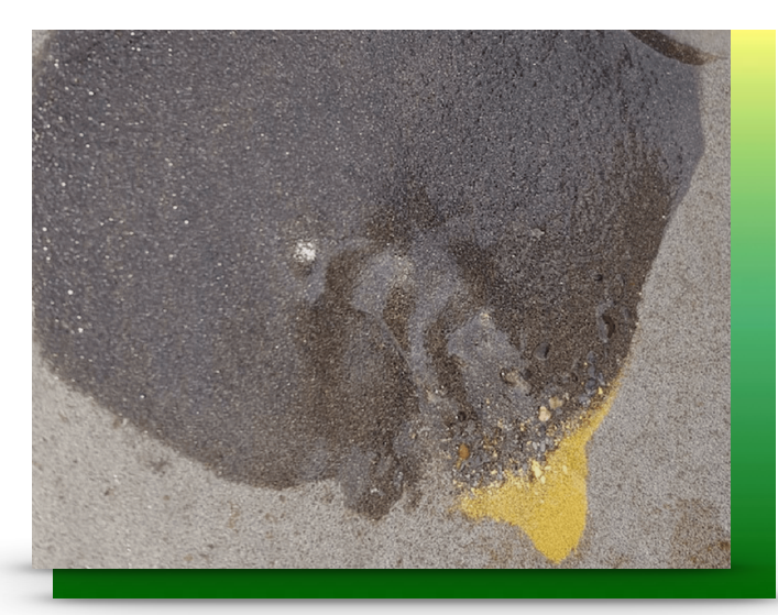
Gold Mining Project