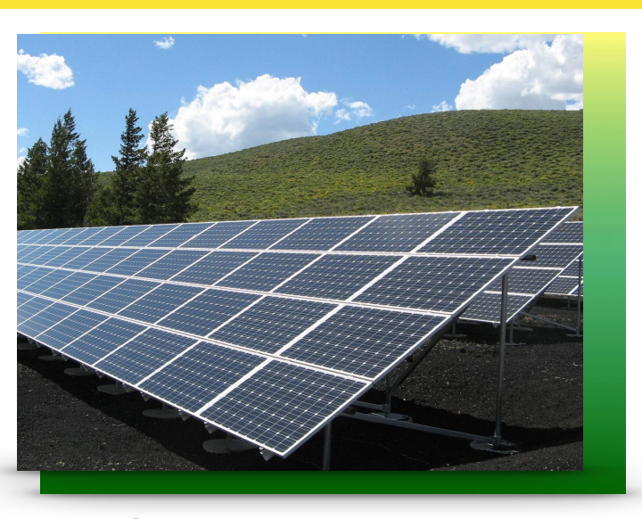
Solar Power Plant Project