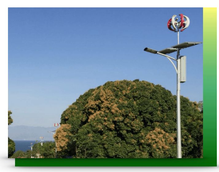
Supplying Street Light & Water Project