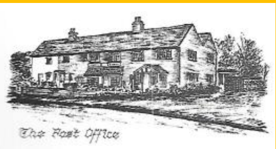
The Post Office