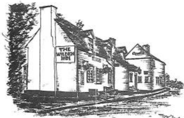
The Wilden Inn