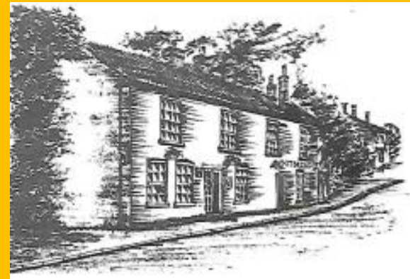
The Rock Tavern