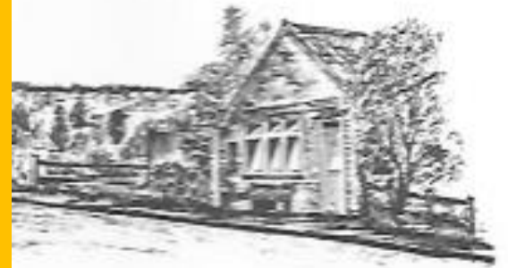
The Round House

IMAGES OF WILDEN COMMISSIONED BY NIC HARVEY 1980