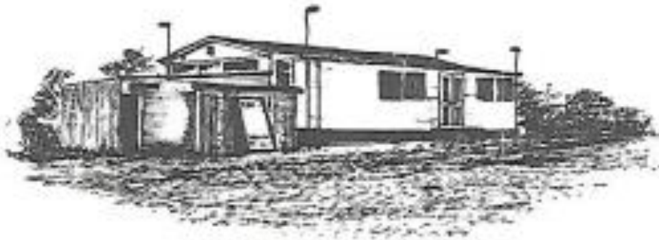
The Cricket Pavilion