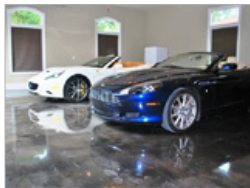
CSI Division 9: Finishes - Flooring