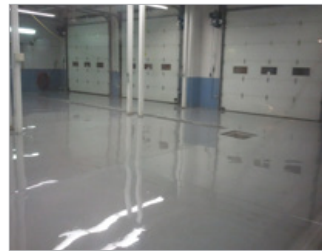
CSI Division 9: Finishes - Flooring