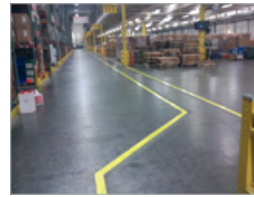
CSI Division 9: Finishes - Flooring