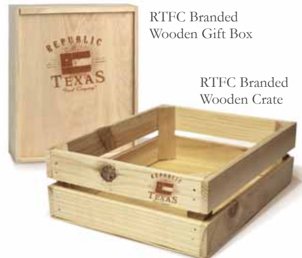
RTFC Branded Wooden Gift Box

Price: $85.99 Order #: TOC-C02 Type: Crate or Box