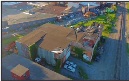
Left: overhead view of the Henckel building.