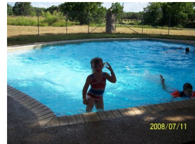
Our Pool is a valuable asset

Durham Park Association has a community swimming pool that has recently undergone extensive repair/refinishing. The pool refinishing project included removing the old pool liner and replacing it with new plaster. This new plaster cannot be left exposed to the elements, therefore the pool must remain filled with water at all times. Additionally, this plaster can become stained and otherwise damaged by naturally occurring algae's, debris or other foreign materials that may enter the pool if left without maintenance, so the water in the pool must be maintained in proper chemical balance to insure the maximum life of the asset. Finally, the warranty of the work requires that the pool be filled with water at all times.