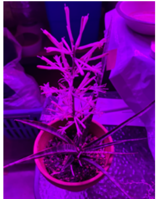
Doris Duke’s Sansevieria trifasciata blooming enthusiastically under a rose-colored grow light.