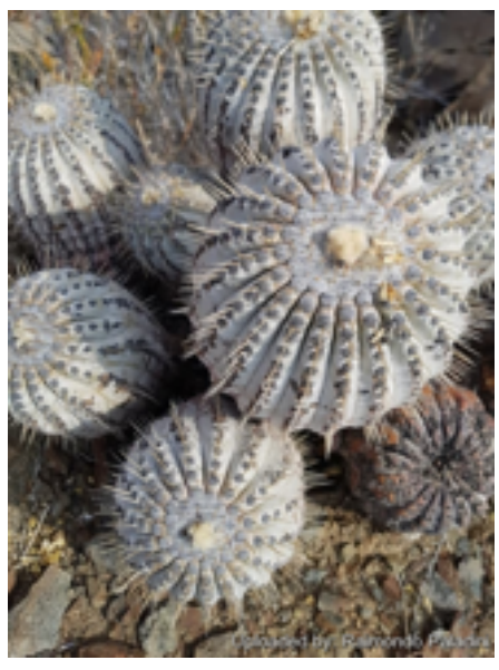
Copiapoa cinerea var. albispina