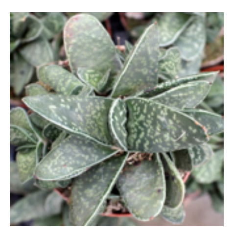
Gasteria 'Green Dragon" hybrid, Mountain Crest Gardens