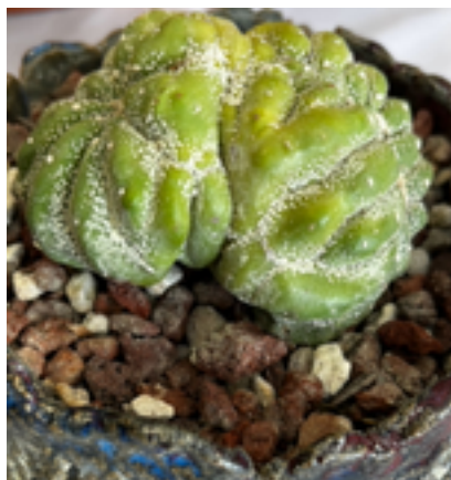
Astrophytum asterias 'Lizard Skin' crest. Brianna Stanley (and a very cool pot, too!)

1 Mammillaria elongata Kay Trieb 9 2 Tephrocactus geometricus Renee Becka 8 3 Tephrocactus geometricus Victor Gress 7 3 Mammillaria spinossima Roy Smith 7