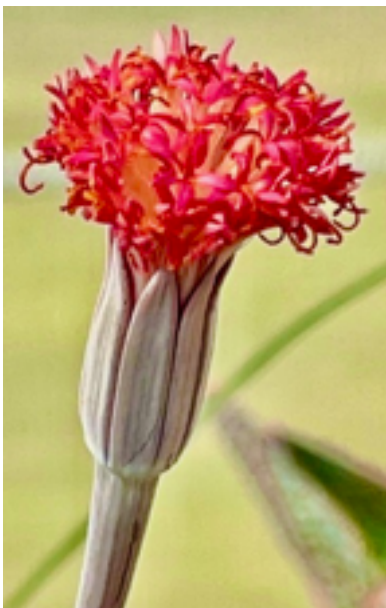
Senecio stapeliiformis flower.