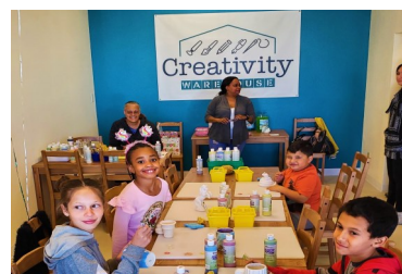
Creativity Warehouse's First Birthday Party

Handbuilding is the process of creating pottery without using the wheel. It is an ancient pottery making technique that involves creating items using the hands, fingers, and simple tools. Slab building, pinch pottery, and coil building are the most common handbuilding techniques. Handbuilding techniques can also be used to enhance a form thrown on the wheel. It is best to learn handbuilding before learning the wheel as it gives you a better idea of what clay is and how it handles.