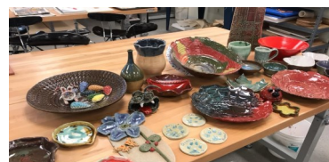
Creativity Warehouse's Treasures out of the Kiln