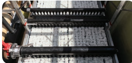
Aquapolo, São Paulo, Brazil

3.2 MGD (12,000 m3/day) MBR System for treatment of municipal wastewater