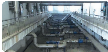
Taixing, Jiangsu, China

13.2 MGD (50,000 m3/d) MBR system for treatment of a mixture of Industrial and Municipal Wastewater