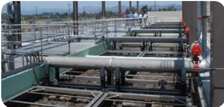
Santa Paula, California USA

3.2 MGD (12,000 m3/day) MBR System for treatment of municipal wastewater