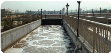
Dongyang, Nanjing, China

14.8 MGD (56,200 m3/d) Tertiary MBR System for treatment of municipal wastewater