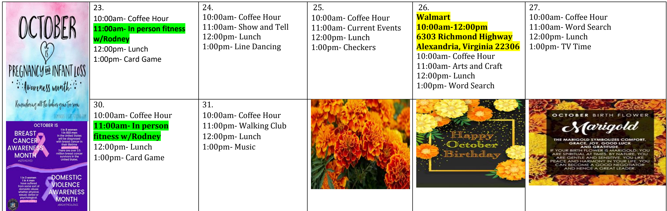
Part of the Senior Services Network – Supported by the Department of Aging and Community Living.