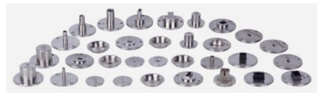
A complete line of connector adapters and tips are available for FiberWarrior Inspection Test Sets.

OptiConcepts FiberWarrior<sup>™</sup> EasyCheck Connector Inspection Test Set is a compact connector inspection endface instrument, freeing up important workspace. By combining a microscope and high resolution monitor, EasyCheck allows easy identification of endface defects. High resolution image sensors and a 8" black and white TFT LCD provide clear images of connector endfaces, including multi-fiber connectors such as MTP and MPO. Scratches and pits from polishing are clearly visible as is any debris from insufficient cleaning of the connector endface. Endface images can be captured and stored on the provided SD card. The FiberWarrior EasyCheck Inspection Test Set provides visual ensurance that connectors have been processed correctly. OptiConcepts Inspection Test Sets are essential instruments for thorough fiber optic connector quality assurance.